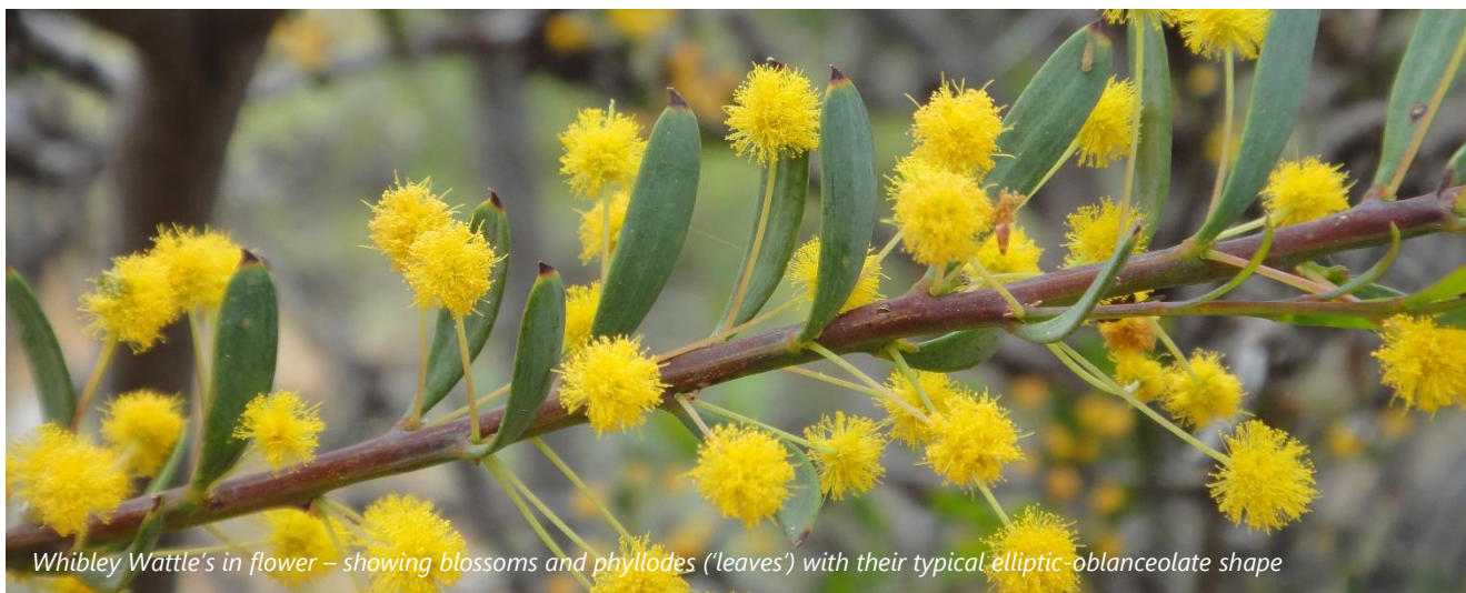
Whibley Wattle's in flower – showing blossoms and phyllodes ('leaves') with their typical elliptic-oblong shape