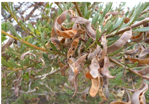
Whibley Wattle seed pods open in summer to release seed.

Whibley Wattle is a dense shrub growing 1.5 to 2.5m high, spreading from 2.5 to 4m wide. The thick phyllodes (not true leaves) are rigid, with one edge more curved, ending in a sharp point. The plant is fairly inconspicuous for most of the year, but bursts into colour with bright golden flowers in September. The brown seed pods are up to 4.5cm long, smooth and twisted in shape, ripening in late December.