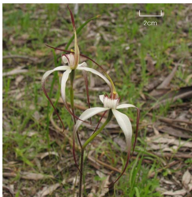
Flowers of Caladenia argocalla .

Caladenia argocalla is an annual, terrestrial orchid. It has a single hairy leaf (12-20 cm long) that emerges in winter. It produces a single flower stem in Oct-Nov (30-60 cm tall) with one or two flowers. The flowers are creamy white, with red fringes on the lip (labellum), which is curled under and sometimes has a red tip. The petals and sepals (9-15 cm long) have reddish tips and are usually drooping.