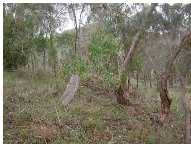
Typical habitat of Caladenia argocalla .

It usually grows on gentle hill slopes, often with a southerly aspect in clay loam soils with high humus content.