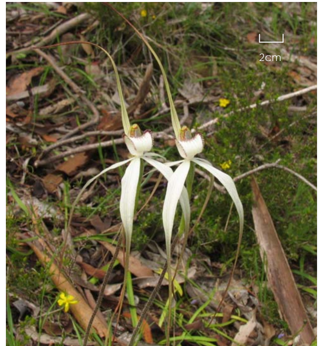
Flowers of Caladenia argocalla .

You can also volunteer your time to assist with surveys, monitoring, weed control, fencing, and other recovery actions for the species.