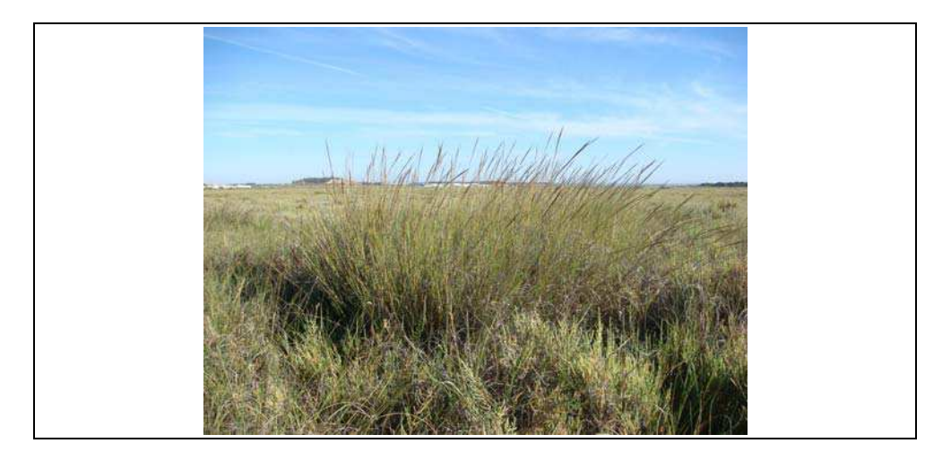
Fig. 3. Clump of the hybrid Spartina densiflora x maritima surrounded by S. densiflora and Sarcocornia fruticosa in Guadiana Marshes (Southwest Iberian Peninsula).

Table 1. Growth-form ('guerrilla' or 'phalanx' after Lovett Doust & Lovett Doust (1982)) and mean above- and below-ground biomass (AGB and BGB, respectively; in g DW m<sup>-2</sup>) studied location, applied sampling method and source for some cordgrasses species ( Spartina genus) colonizing coastal marshes.