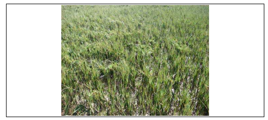
Fig. 4. Spartina maritima prairie, a cordgrass with "guerilla" growth from, starting to be outcompeted by Sarcocornia perennis supspecies perennis in Odiel Marshes (Southwest Iberian Peninsula).