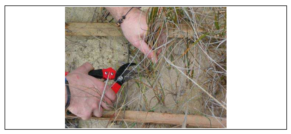
Fig. 2. Sampling Spartina versicolor above-ground biomass along a transect in a representative tussock. Each transect was a belt of contiguous quadrants (10 cm radially \times 15 cm wide) across the radius of a tussock; every quadrant sampled a concentric ring around the tussock centre so that the results integrated the zones of different density within the clone.

Temporal changes in subterranean biomass of cordgrasses are not well established. However, Spartina below-ground biomass does not seem to show as clear a temporal pattern as the aerial biomass does, with higher accumulations at the end of the warmer season (Darby & Turner, 2008b).