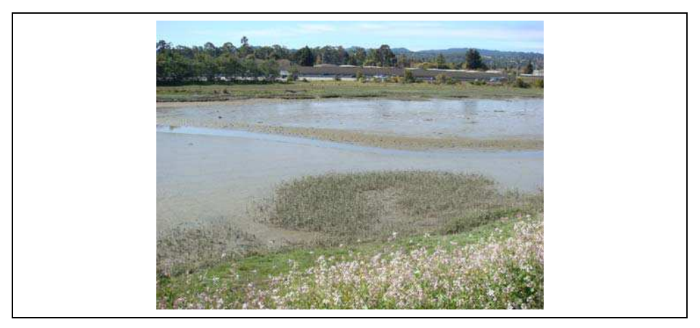
Fig. 5. Clump of the hybrid of Spartina foliosa x alterniflora colonizing a mudflat, where the native Spartina foliosa is not able to survive, in San Francisco Bay (California).

(Castellanos et al., 1994; Castillo et al., 2000; Proffitt et al., 2005). Thus, sediment deposition develops with the establishment of these foundation cordgrasses at low marshes, which yields abiotic environmental changes such as decreasing anoxia and flooding period (Castellanos et al., 1994; Craft et al., 2003; Bouma et al., 2005; Castillo et al., 2008a; Castillo et al., 2008b).