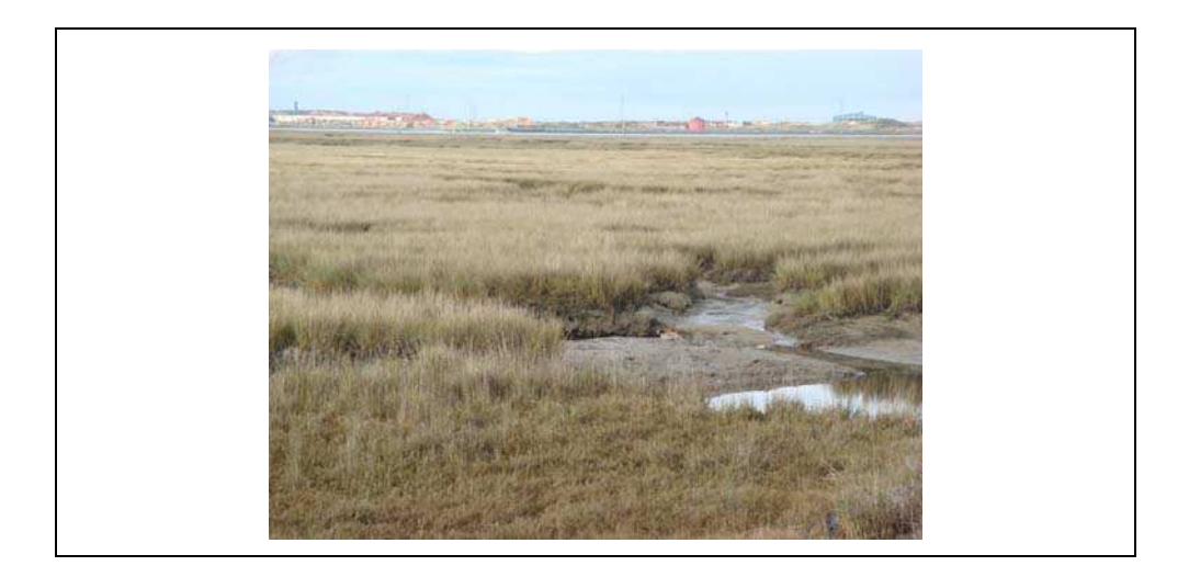
Fig. 6. Salt marsh invaded by the South American neophyte Spartina densiflora in Humboldt Bay, California.

Future research is needed specially to improve our knowledge about cordgrass belowground biomass accumulation, dynamic and functions. The evaluation of the salt marsh ecosystem will be incomplete if based exclusively on what is happening aboveground, or as though what happens aboveground is a satisfactory indicator of what is driving changes belowground. Monitoring programs, for example, could be improved if belowground soil processes were included, rather than excluded, as happens frequently. Furthermore, it may be that because of the dominance of the changes in biomass pools belowground compared to aboveground, what happens belowground may be more influential to the long-term maintenance of the salt marsh than are changes in the aboveground components.