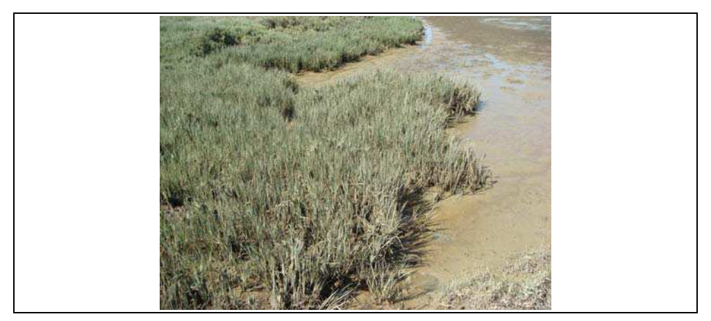
Fig. 1. Small cordgrass ( Spartina maritima ) grows on intertidal mudflats in European salt marshes where it forms continuous prairies with its coalescent clumps that colonize bare sediments with long rhizomes.