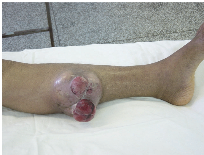
Fig. 2. Large tumors representing an adverse effect in survival

The factors associated with tumors seem to be the most important ones to determine the prognostic of systemic spread. Among them, we call special attention for size, histological and genetic aspects and the histological subtypes.