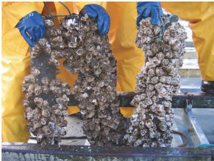
Fig. 3. "Giant barnacle", Austromegabalanus psittacus , spat collection from the wild, southern, Chile.

during late spring/early summer (Pham et al., 2011). Recent experiments showed that the choice of materials and their orientation are important factors to be considered for optimizing recruitment values and future spat collector designs (Pham et al., unpublished data). Densities on material placed horizontally, whatever its category, are higher than when material is placed vertically. This difference is particularly pronounced for the most efficient material tested, PVC plates. PVC plates should be considered for the design of spat collection structures.