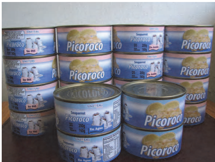
Fig. 5. Canned products of “giant barnacle”.

With regard to markets and prices, the “goose barnacles” can reach prices of between €15-25/Kg on the Iberian market. Of the “acorn barnacle” species, the “giant barnacle” is commercialized on the local Chilean market at prices that range between US$1.5/Kg and 20/Kg. The “mine fujit subo” reaches between US$12-15/Kg on the Japanese market and the “craca”, between €2.5-5/Kg on the local market of the Azores Islands, Portugal (López et al., 2010). Market studies of the “giant barnacle” in Japan indicate that some products can reach up to US$25/Kg. “Giant barnacle” cultures on the Chilean coast have generated an interest in its commercialization in the USA and on the Iberian market.