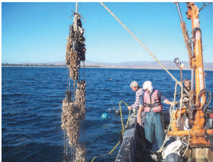
Fig. 4. "Giant barnacle" culture growth system in northern Chile.

Instantaneous growth rates decrease with age, fluctuating from 0.03 cm/day carino-rostral length at the beginning of growth, to 0.0005 cm/day carino-rostral length after 20 months.