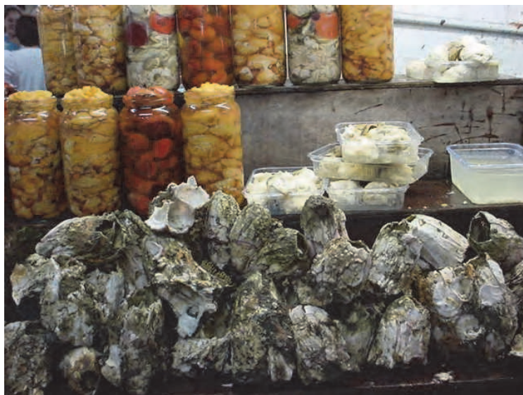
Fig. 2. "Giant barnacle" in a local market in Puerto Montt city, southern Chile.

juveniles in artificial floating substrates (Goldberg, 1984). Results have been scarce, mainly because, in this species, larval settlement is determined by the presence of conspecific adults (Molares et al., 1994; Cruz et al., 2010). Among balanomorph barnacles, similar experiments have been undertaken on Megabalanus azoricus in the Azores islands, where technologies have been designed for installing collectors in the water column. The results indicate that larval settlement occurs, although it is still not possible to ensure that levels are sufficient for industrial scale cultures (Pham et al., 2008; Pham & Silva, 2010; López et al., 2010). Thus, progress has been made, on an experimental level, with these two species, in the area of spat collection from the wild. The only species where studies have advanced from experimental to semi-industrial cultures, is the "giant barnacle", "picoroco", Austromegabalanus psittacus , on the Chilean coast. In this species, it has been shown that levels of spat collection from the wild will permit the development of commercial cultures. Similarly, the growth rates enable specimens of a commercial size to be obtained over a short period of time (López, 2008; López et al., 2010). Furthermore, low cost production technologies have been developed to obtain spat and to enhance growth. The yield and economic feasibility of various products have also been evaluated (Bedecarratz et al., 2011).