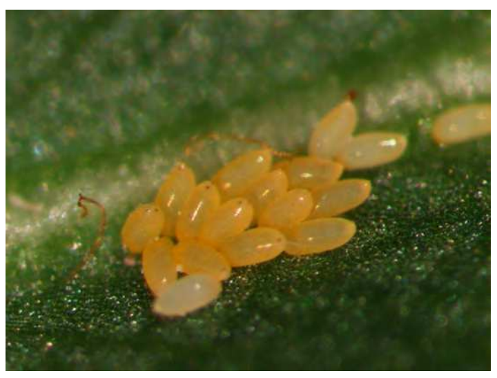
Fig. 6. C. pyri eggs.

From eggs laid in winter months, simultaneously to bud opening, the first instar nymphs emerge, infesting the new vegetation. Later, in April-May, the adult summer forms appear (Fig. 5) whose females lay a large number of eggs (Fig. 6) hatching in the second half of May. The first instar (Fig. 7) and late instar nymphs (Fig. 8) live on the shoots, excreting a large amount of honeydew responsible for heavy damages to the plant. The next generations overlap with all developmental stages until autumn. Aestivation is also observed during the summer months.