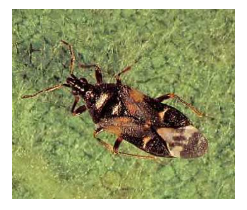
Fig. 14. Adult of A. nemoralis.

The previously mentioned limits of natural control led to artificially introduce anthocorids in the pear orchard, buying them from biofactories and thus performing a true biological control technique. The aim is to obtain a more numerous presence of the predator in the critical periods, anticipating the reproduction mechanism of the population which could occur naturally but with some delay. The introduction of predators is performed at the end of winter, between the end of March and the beginning of April. About 1000 adult individuals of A. nemoralis are placed per hectare of the pear orchard, in three consecutive weekly introductions. This biological control technique was common around 2000 in integrated pear orchards where the active ingredient amitraz was employed for the spring-summer control of C. pyri , then it was slowly neglected because of the limited results and the relatively high costs.