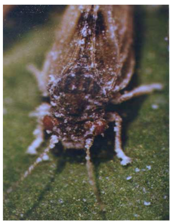
Fig. 10. C. pyri adult with body soiled by kaolin.