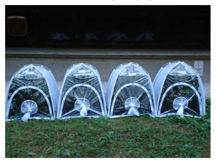
Fig. 12. Cages for potted pear plants to keep adults of different population separated.

undergoing 6-7 treatments. The tests were performed both on adults and nymphs and no evidence of a high RR was found (Miarnau et al., 2010). However, there are some Spanish populations of C. pyri that show low susceptibility in adults as well as in nymphs: these populations come from the fields with the highest number of abamectin treatments per year. As in Emilia-Romagna, these cases also indicate a high risk of selection for resistance to abamectin, especially if the number of treatments per year is high and there are no alternative products to use in a resistance management program.