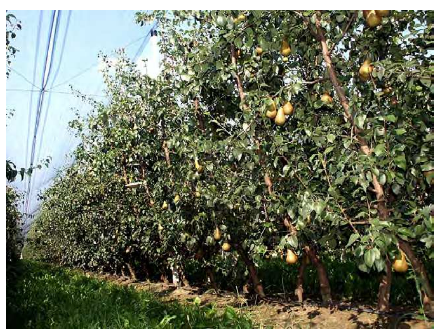
Fig. 1. Pear orchard with high plant density.