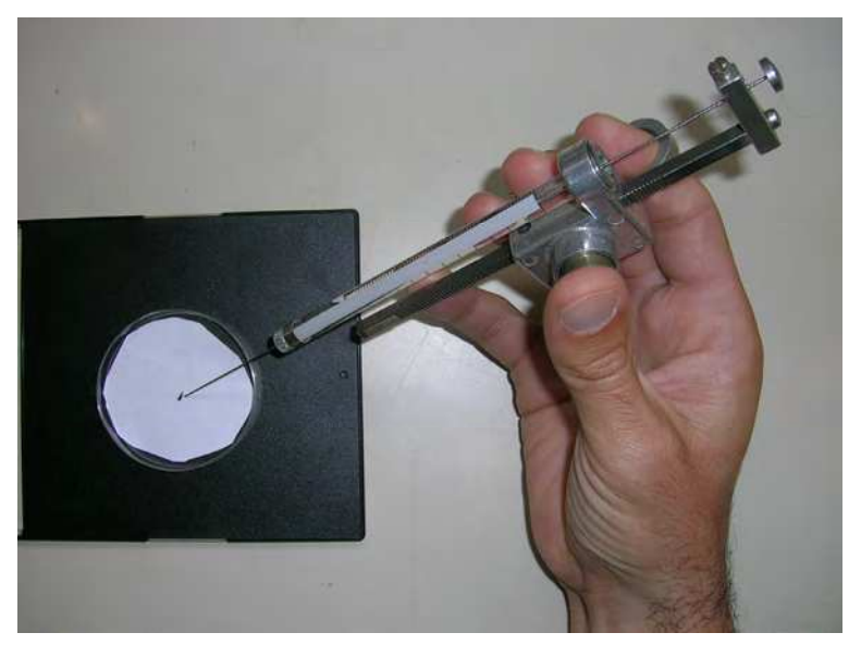
Fig. 11. Topical application of the insecticide solution on C. pyri adult winter form with hand-held manual micro-applicator.

Besides adults (Table 5) (Fig. 11), in 2007 and 2008 the abamectin tests in Emilia-Romagna were extended also to eggs and nymphs (Fig. 12 and Fig. 13), the stage target in C. pyri field treatments (Civolani et al., 2010). On adults, the abamectin topical tests performed in autumn 2007 and 2008 did not show significant differences among all populations tested, but the LC_{50} values were apparently related to the adult collection dates, as previously reported (Civolani et al., 2010).