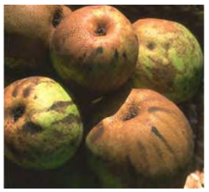
Fig. 2. Damages to fruits due to sooty molds.