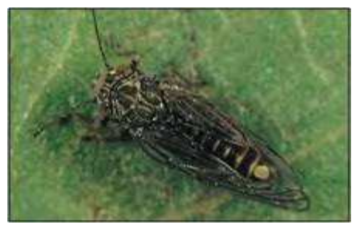
Fig. 4. C. pyri adult winter form.

tree bark, at branch crossing or at the base of buds. As soon as the weather conditions improve, the winter forms leave their shelter and reach the new apical leaves. Here they puncture the buds with their stylets, sucking and excreting fecal droplets which accumulate near the proctiger. In winter the adult male produces active sperms stored in the spermatheca and is therefore ready to mate and inseminate the female. However, the eggs can be fertilized only when oocytes reach maturity (Bonnemaison et al. , 1956). In January all females are mature, ready to mate and lay eggs. The main factor affecting the physiology of ovopository apparatus is temperature, which must be higher than 10° C for two consecutive days (thermal quiescence) (Nguyen, 1975).