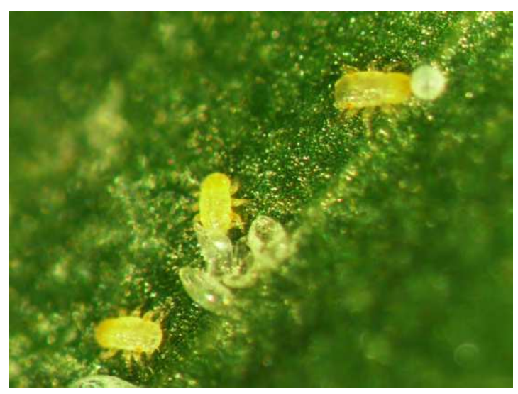
Fig. 7. Newly hatched C. pyri nymphs