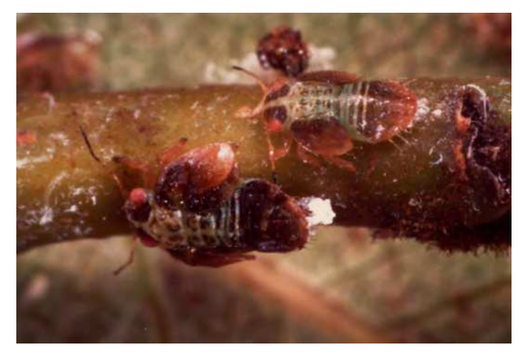
Fig. 8. C. pyri late instar nymphs.