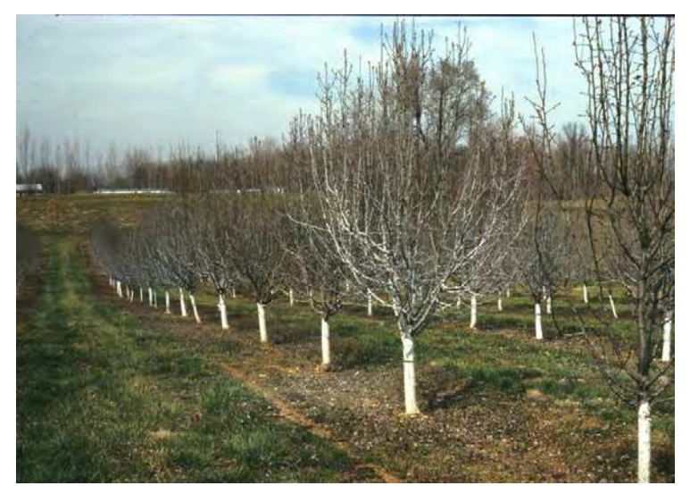
Fig. 9. Pear trees treated with kaolin in late winter.