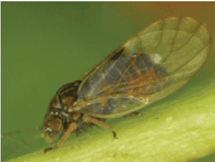
Fig. 5. C. pyri adult summer form.