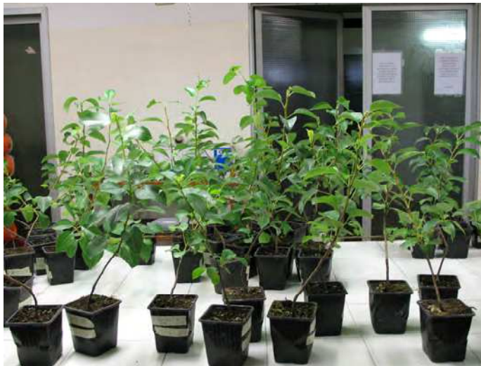
Fig. 13. Potted young pear plants on which psylla eggs were laid and then treated with abamectin.