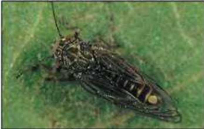
Fig. 4. C. pyri adult winter form.

tree bark, at branch crossing or at the base of buds. As soon as the weather conditions improve, the winter forms leave their shelter and reach the new apical leaves. Here they puncture the buds with their stylets, sucking and excreting fecal droplets which accumulate near the proctiger. In winter the adult male produces active sperms stored in the spermatheca and is therefore ready to mate and inseminate the female. However, the eggs can be fertilized only when oocytes reach maturity (Bonnemaïson et al. , 1956). In January all females are mature, ready to mate and lay eggs. The main factor affecting the physiology of ovopository apparatus is temperature, which must be higher than 10° C for two consecutive days (thermal quiescence) (Nguyen, 1975).