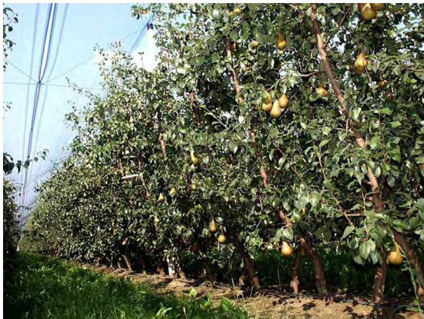
Fig. 1. Pear orchard with high plant density.