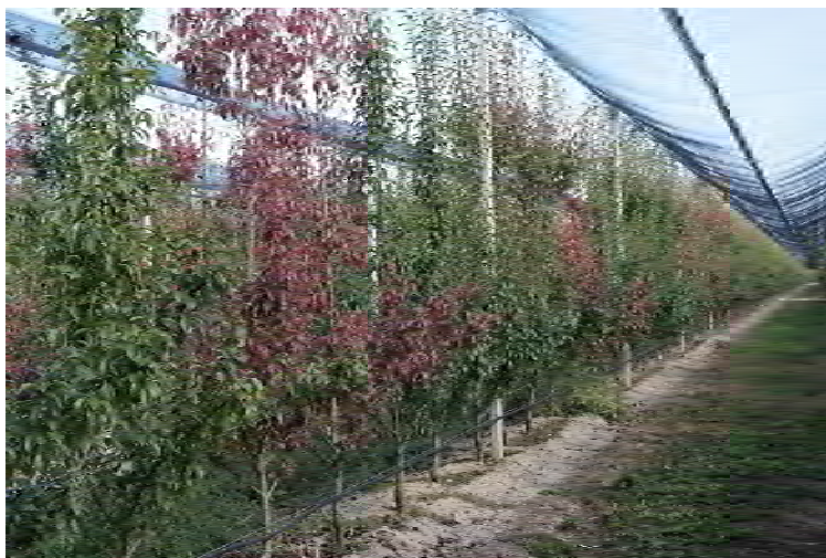
Fig. 3. Damages caused by phytoplasmas.