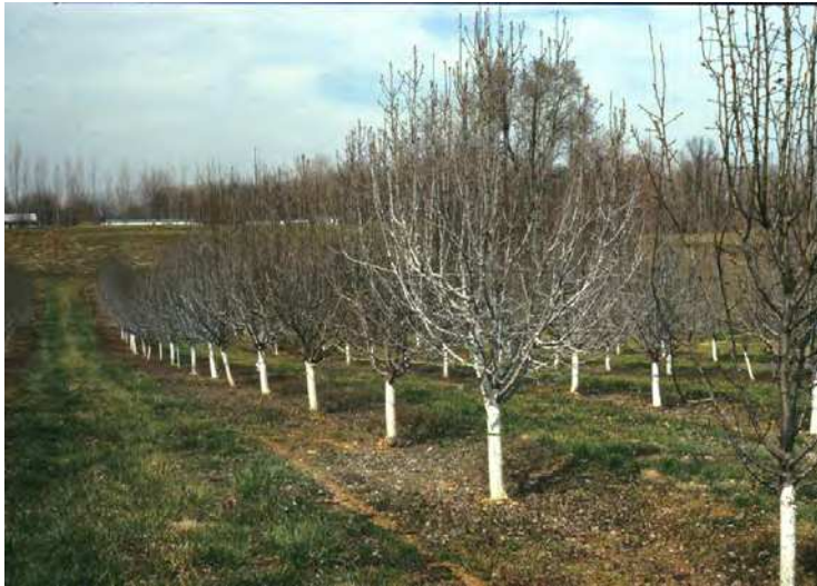
Fig. 9. Pear trees treated with kaolin in late winter.