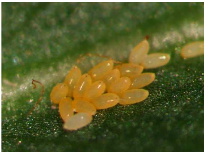
Fig. 6. C. pyri eggs.

From eggs laid in winter months, simultaneously to bud opening, the first instar nymphs emerge, infesting the new vegetation. Later, in April-May, the adult summer forms appear (Fig. 5) whose females lay a large number of eggs (Fig. 6) hatching in the second half of May. The first instar (Fig. 7) and late instar nymphs (Fig. 8) live on the shoots, excreting a large amount of honeydew responsible for heavy damages to the plant. The next generations overlap with all developmental stages until autumn. Aestivation is also observed during the summer months.