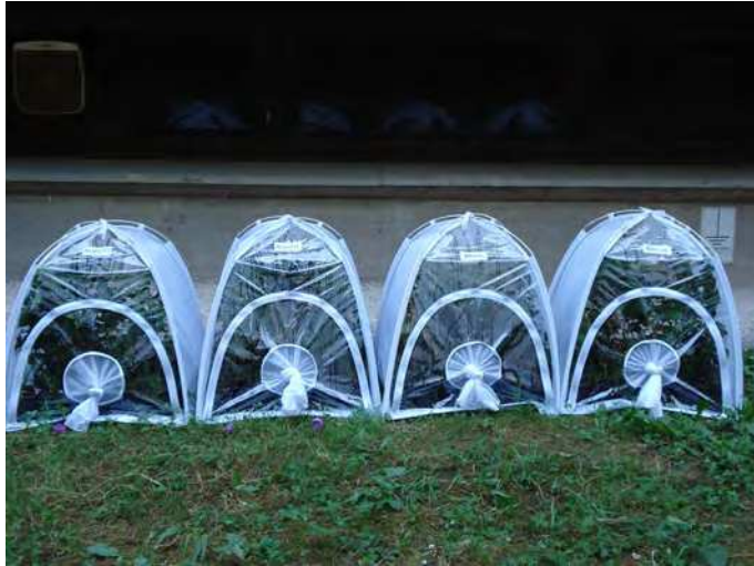
Fig. 12. Cages for potted pear plants to keep adults of different population separated.

undergoing 6-7 treatments. The tests were performed both on adults and nymphs and no evidence of a high RR was found (Miarnau et al., 2010). However, there are some Spanish populations of C. pyri that show low susceptibility in adults as well as in nymphs: these populations come from the fields with the highest number of abamectin treatments per year. As in Emilia-Romagna, these cases also indicate a high risk of selection for resistance to abamectin, especially if the number of treatments per year is high and there are no alternative products to use in a resistance management program.