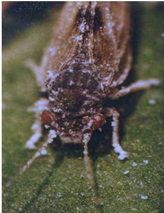
Fig. 10. C. pyri adult with body soiled by kaolin.