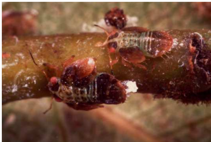
Fig. 8. C. pyri late instar nymphs.