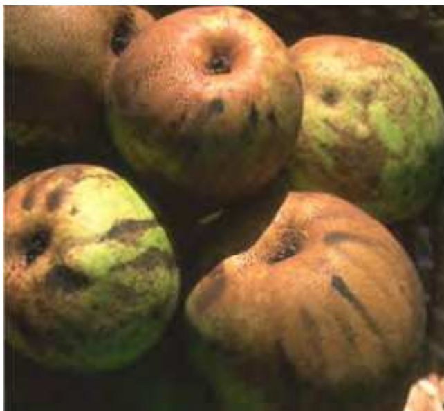
Fig. 2. Damages to fruits due to sooty molds.