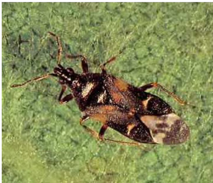
Fig. 14. Adult of A. nemoralis .

The previously mentioned limits of natural control led to artificially introduce anthocorids in the pear orchard, buying them from biofactories and thus performing a true biological control technique. The aim is to obtain a more numerous presence of the predator in the critical periods, anticipating the reproduction mechanism of the population which could occur naturally but with some delay. The introduction of predators is performed at the end of winter, between the end of March and the beginning of April. About 1000 adult individuals of A. nemoralis are placed per hectare of the pear orchard, in three consecutive weekly introductions. This biological control technique was common around 2000 in integrated pear orchards where the active ingredient amitraz was employed for the spring-summer control of C. pyri , then it was slowly neglected because of the limited results and the relatively high costs.