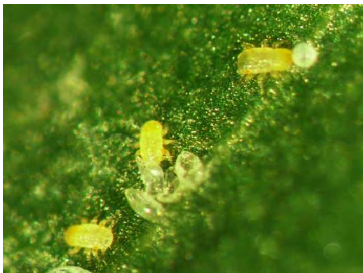
Fig. 7. Newly hatched C. pyri nymphs