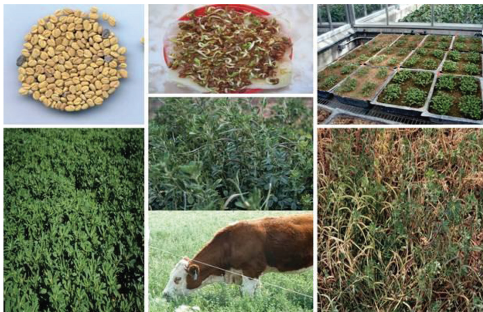
Figure 1. Fenugreek crop in different growth stages (fenugreek seed, seed germination, seedling growth, vegetative-immature and reproductive growth stages of stem formation, podding and physiological ripeness-mature.

Fenugreek is also well known as a global spice crop grown in all the major continents (depending on soil and climatic conditions) across the globe including parts of North Africa, Mediterranean Europe, Russia, Middle East, China, India, Pakistan, Iran, Afghanistan, parts of Far East and SE Asia, Australia, the USA, Canada and Argentina [7, 8]. India once maintained and still holds the largest fenugreek harvested area in the world [5].