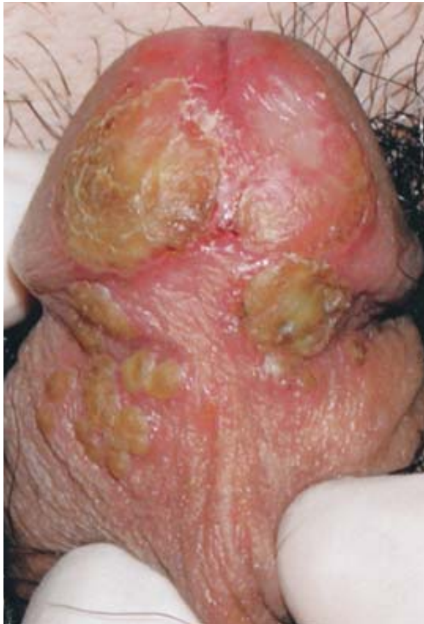
Figure 1. Thick-crusting plaques present on the glans penis.

one week to one month, ocular symptoms develop, such as sterile conjunctivitis or iritis, combined with oligoarthritis. The oligoarthritis is usually asymmetric and affects the lower extremities, including the knees or ankles. Enthesopathy, or inflammation of tendons at their insertions, especially the Achilles tendon, and dactylitis, or “sausage digits,” also may occur. Constitutional symptoms, such as fever and weight loss, are not uncommon during the acute phase of Reiter's syndrome. 1