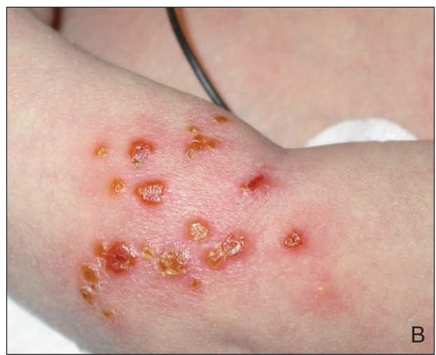
Figure 1. Vesiculopustular eruption on the face (A) and left arm (B).

On admission, the neonate was afebrile and had normal findings from a general physical examination. Routine laboratory tests showed an elevated white blood cell count at 65.2×10<sup>9</sup>/L. The elevated white blood cell count persisted, and therapy was started the next day (day 10 of life) with amoxicillin and topical aqueous solution of eosin 2%. The papular eruption worsened and the neonate developed numerous, grouped, papulovesicular and papulopustular lesions with underlying erythema as well as some yellowish crusts on the cheeks, eyelids, and arms (Figure 1); there was no lymphadenopathy. Abdominal examination showed an enlarged liver and spleen; the liver edge was palpable 2 cm below the right costal margin, and the splenic tip was palpable 1 cm from the left costal margin. On day 12, routine laboratory tests still showed a persistently elevated white blood cell count (66.9 \times 10^9/L) with 70% blasts and an elevated lactate dehydrogenase concentration at 1780 U/L (reference range, 100-200 U/L). Blood and urine cultures and swabs from the skin lesions detected no bacterial infection. Tzanck test results were negative and polymerase chain reaction analysis was negative for herpes viruses. The neonate had normal neurologic examination findings, and she was feeding well and afebrile.