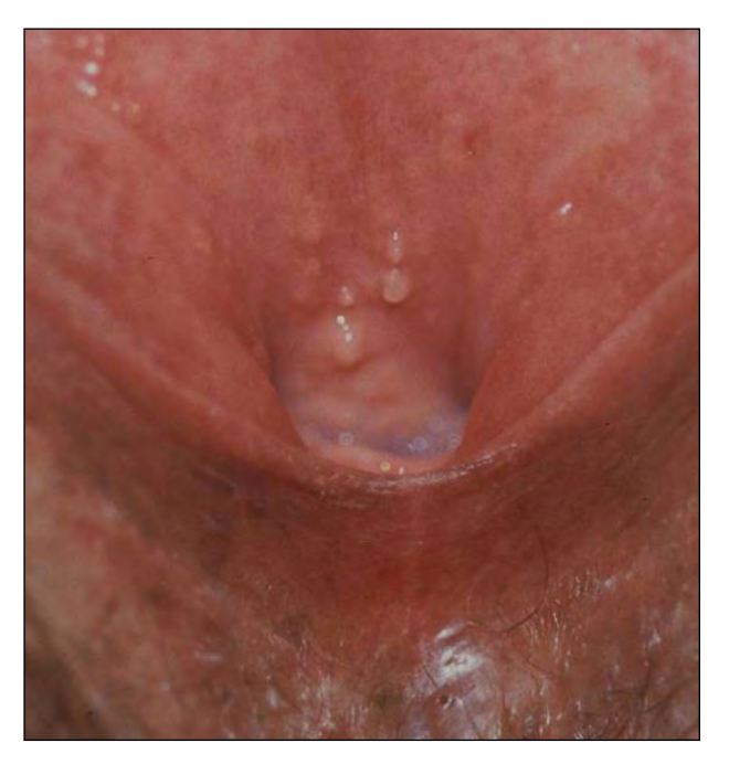
Figure 1. Vaginal introitus with several small, discrete, pearly, round, filiform, papular projections.

A previously healthy 46-year-old woman presented to our university-associated dermatology practice for an evaluation of suspected genital warts. She first noticed the lesions 3 years prior to presentation; they had been stable in size and distribution since that time. There were no associated symptoms. Physical examination revealed approximately fifteen 1- to 2-mm pearly, flesh-colored, filiform, round and papular projections of the inner labia minora and vaginal introitus (Figure 1). Biopsy of 1 lesion revealed a polypoid growth with mild acanthosis, fibroplasia, and dilated blood vessels (Figure 2). Koilocytes were not seen and periodic acid-Schiff staining was negative for yeast or hyphae. Immunohistochemical staining for human papillomavirus (HPV) was negative. The findings were consistent with a diagnosis of vestibular papillomatosis (VP).