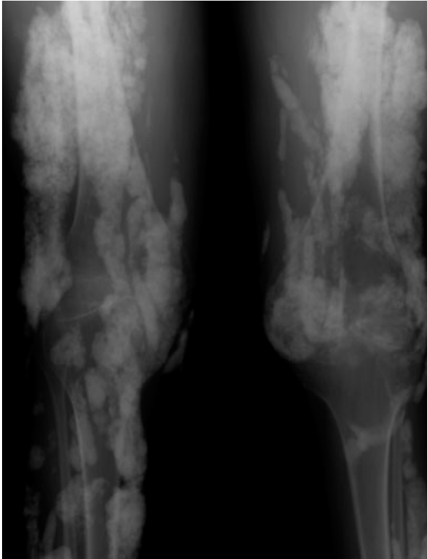
FIGURE 3. X-ray of legs.