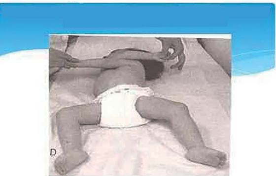
Figures 1A. D Hypotonia.

2) Horizontal suspension: When children are suspended horizontally, they should be able to maintain their heads in an erect position in the horizontal plane; backs in a straight posture; and elbows, knees, ankles, and hips in a flexed state. Floppy infants tend to drape over the examiner's hands, with the head and limbs hanging loosely (Figure 1 B).