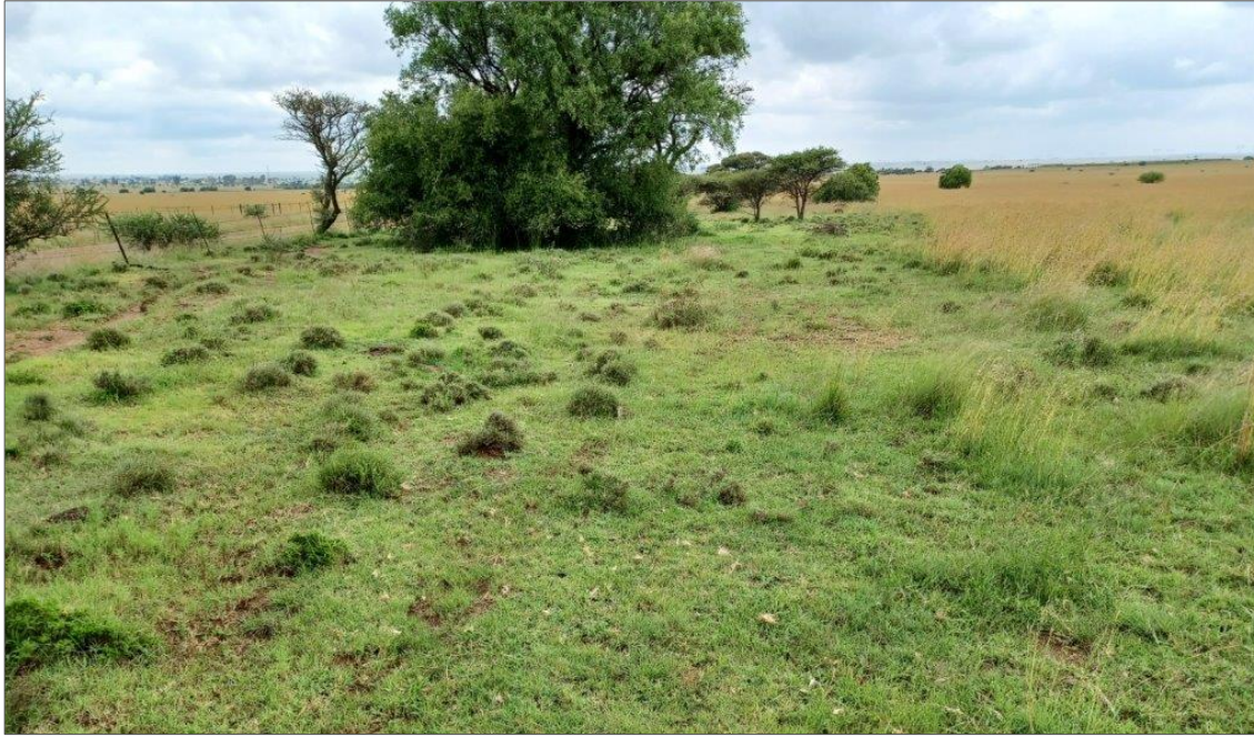
Figure 4. 2: Cynodon dactylon , showing dense, creeping growth habit. This is ideal for protecting the soil surface and binding the topsoil. It also able to withstand heavy grazing and trampling. Ideal for vegetating slopes and drainage swales.