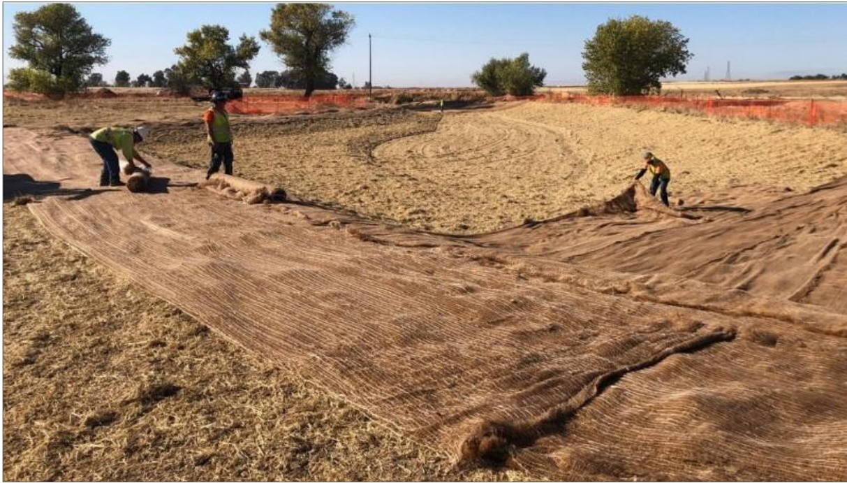
Figure 4. 3: Straw mulching together with an example of a biodegradable erosion control soil saver