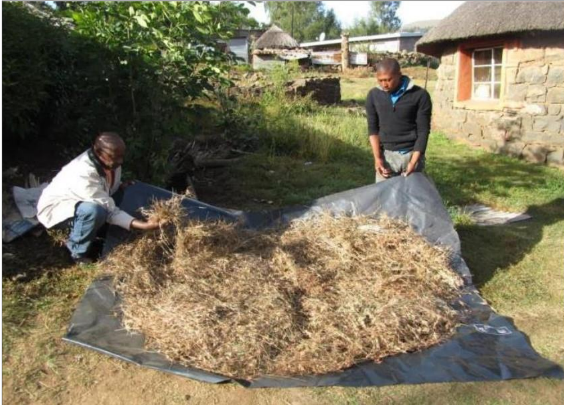
Figure 4. 1: Recently harvested indigenous grass seeds being aerated during the drying process

commercial crops, but experience has shown that germination percentages are reasonable (Kirkman, 2013), reasonable cover can be achieved and reasonable levels of biodiversity.