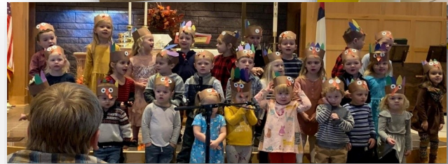
Preschool Sunday 2021