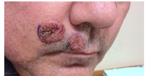
Figure 1. Multiple centrofacial, well-demarcated, erythematous, verrucous plaques with overlying crust and central ulceration.

When found in the environment, B. dermatitidis grows in the hyphal form at 22 °C to 25 °C. 1,2 The hyphal form has a geographic predilection for forested areas near a water source with associated decayed or rotting wood. 1 Activities that disrupt the soil, such as construction or clearing of brush, cause aerosolization of B. dermatitidis . Infection is