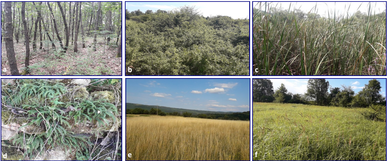
Associations: a — Quercetum frainetto-cerridis , b — Pruno spinosae-Ligustretum vulgaris , c — Typhetum latifoliae , d — Asplenietum rutae-murario-trichomanis , e — Ranunculo-Arrhenatheretum , f — Calamagrostietum epigei .