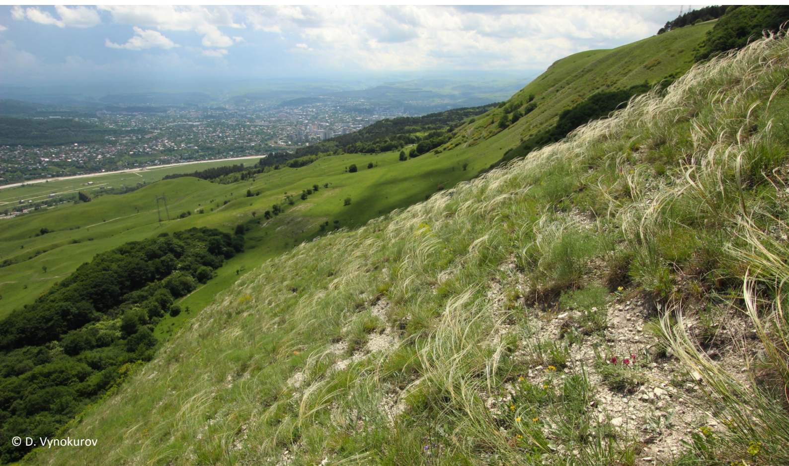
Borgustan Range, near Kislovodsk city, Stavropol Krai, Russia, 01.06.19. Dry grasslands on limestone outcrops with Elytrigia stipifolia , Stipa pulcherrima , Euphorbia petrophila , Genista compacta . Before the storm.