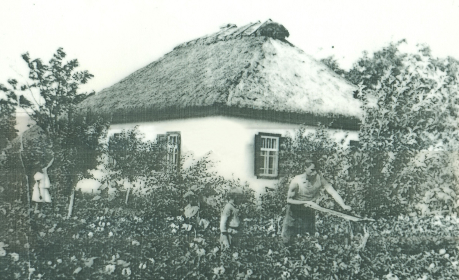
Father's House in Velyka Yablunivka.