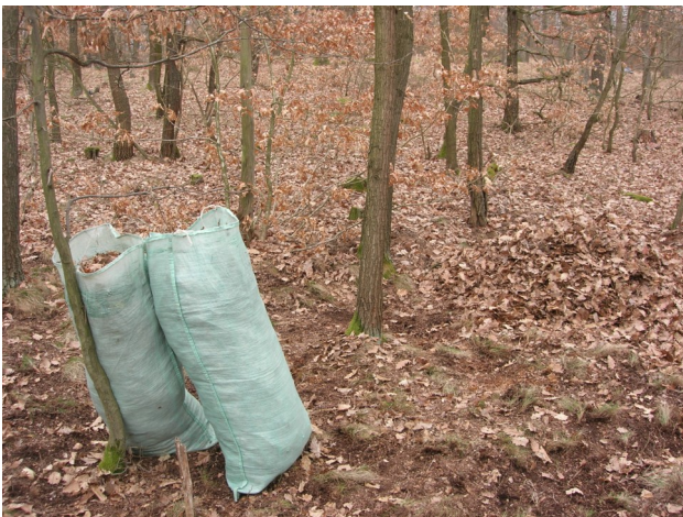
Experimental sites: woodland pasture, coppice-with-standards forest and litter raking experiment.

removal of litter layer, which otherwise acts as a mechanical barrier buffering temperature and humidity fluctuations. Grazing animals probably enhanced the nutrient supply directly by the excretion of mineralized nutrients in the form of urine and feces and also maintained the open forest environment.