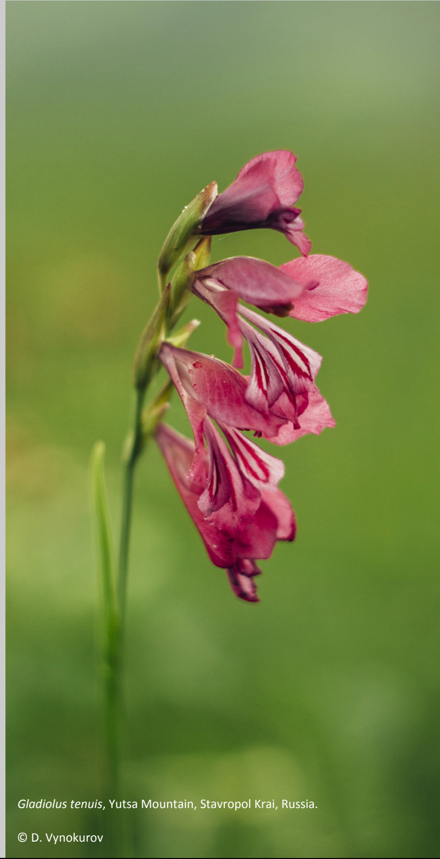
Gladiolus tenuis , Yutsa Mountain, Stavropol Krai, Russia.

14 Recently defended thesis in vegetation science