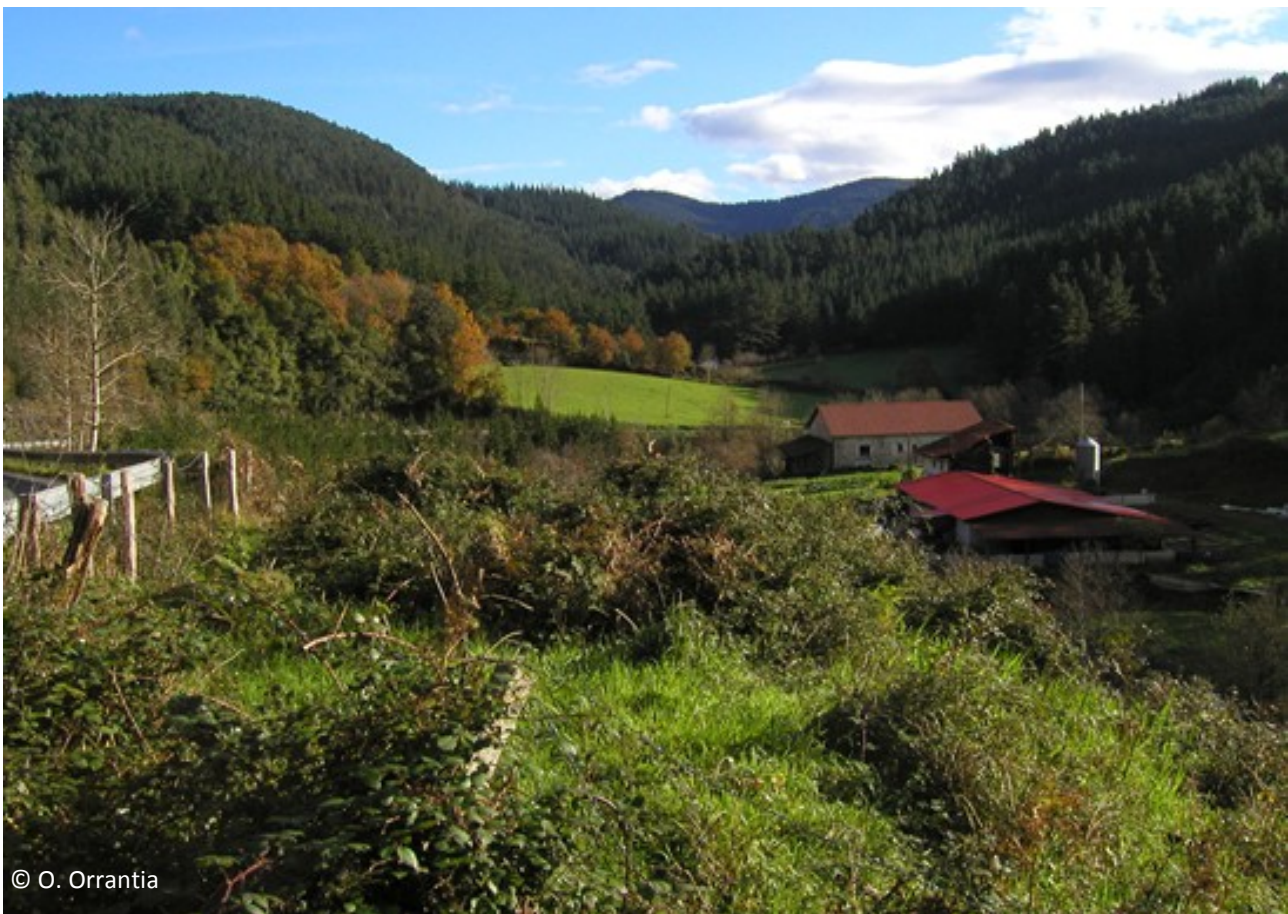
Lowland landscape at Golako river basin: several farms with orchards, pastures and/or meadows related to them and a main use of plantations of mostly Pinus radiata but with an increment in Eucalyptus spp. significance.