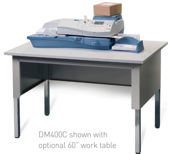
DM400C shown with optional 60" work table

Enhanced Accounting PC Interface Report Printer Differential Weighing Barcode Scanner