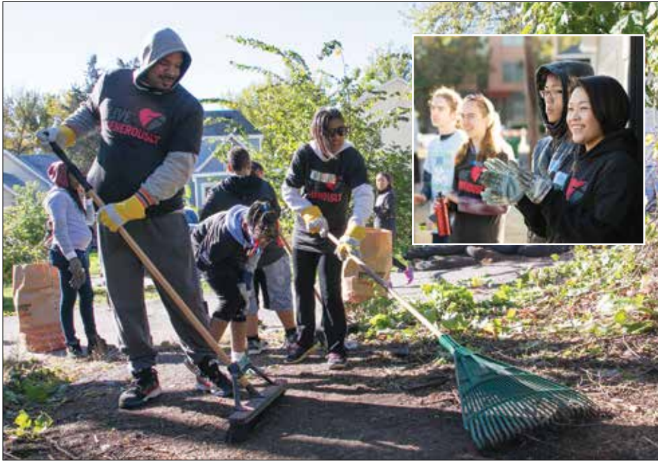
Crews of close to 200 volunteers hit an alley in the Frogtown neighborhood, cleaning, trimming and picking-up to make the area prettier and safer.

Frogtown, St. Paul was the place to be on October 3! Close to 200 people including residents, students from nearby schools, community partners, and Twin Cities Habitat employees and volunteers showed up to work and hang out at Garage-A-Palooza.