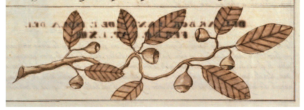
Figure 2.- Achromatic watercolour of Ocotea foetens (Aiton) Baill. (Lauraceae) from the island of El Hierro found in Torriani's (1592) manuscript. It is likely that the painting was made by Leonardo Torriani.

a corea er cendenta poi fuori pei rami e per le fogle. Illinio voriae ci in questa goeta gle alcori da quale n vono rimile alle focule, bianche alcuni, er altri neri, er che da bianche si caua l'acqua baena da bece, cr qua amara che l'uno e l'altro i falso, perioche questo albero farca er altri della propria naruna er del ato uno simile alle focule, ce acci, ne bianche, ne da loro si caua acqua ne buona ne amara. Convon è altro che la intorrumbile Affia di che è adorno il dilutranole Parchenio del divino sanalazo l'aquale i ed è duea, nedora, ce odorifora; ha le foglie aeruese er simili à quelle del laveo, ce il fruevo metto gianda, d'unericati cami, giamai n'fronda ne vene à geande altorra. In quese tre gole traiden universe riglie che danno acqua buona però non n'a consideratione se non di questa che i forrine che