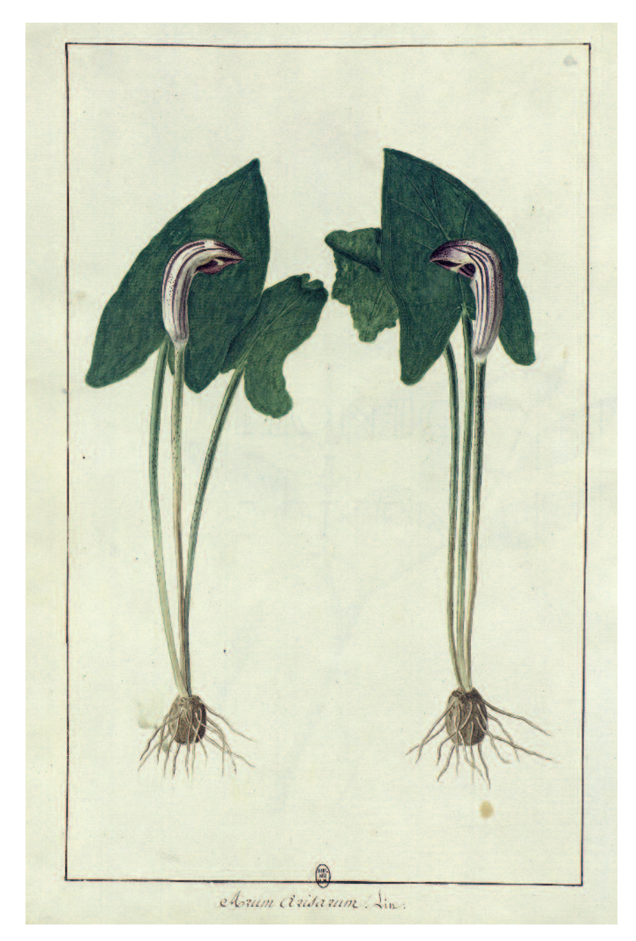
Figure 7.- Watercolour of the likely Canarian native Arisarum simorrhinum Durieu (Araceae) found in Ledru's (1797) manuscript. Image copyright of the Natural History Museum of Paris (manuscript number 2547).