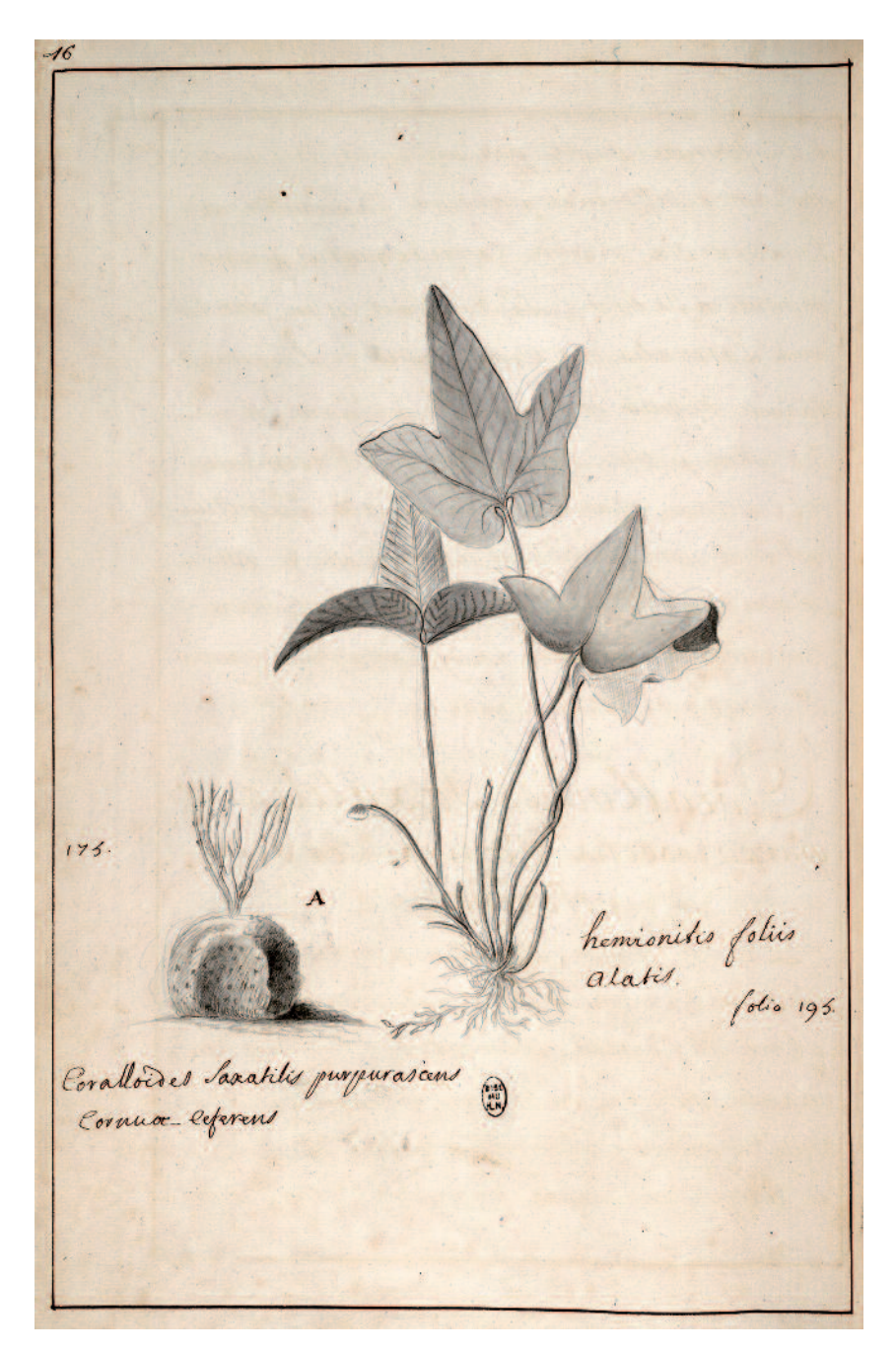
Figure 5.- Achromatic watercolour of the Canarian natives (non-endemic) Asplenium hemionitis L. (Aspleniaceae) (right) and Roccella cf. tinctoria DC. (Roccellaceae) (left) found in Feuillée's (1724) manuscript. (manuscript number 38).