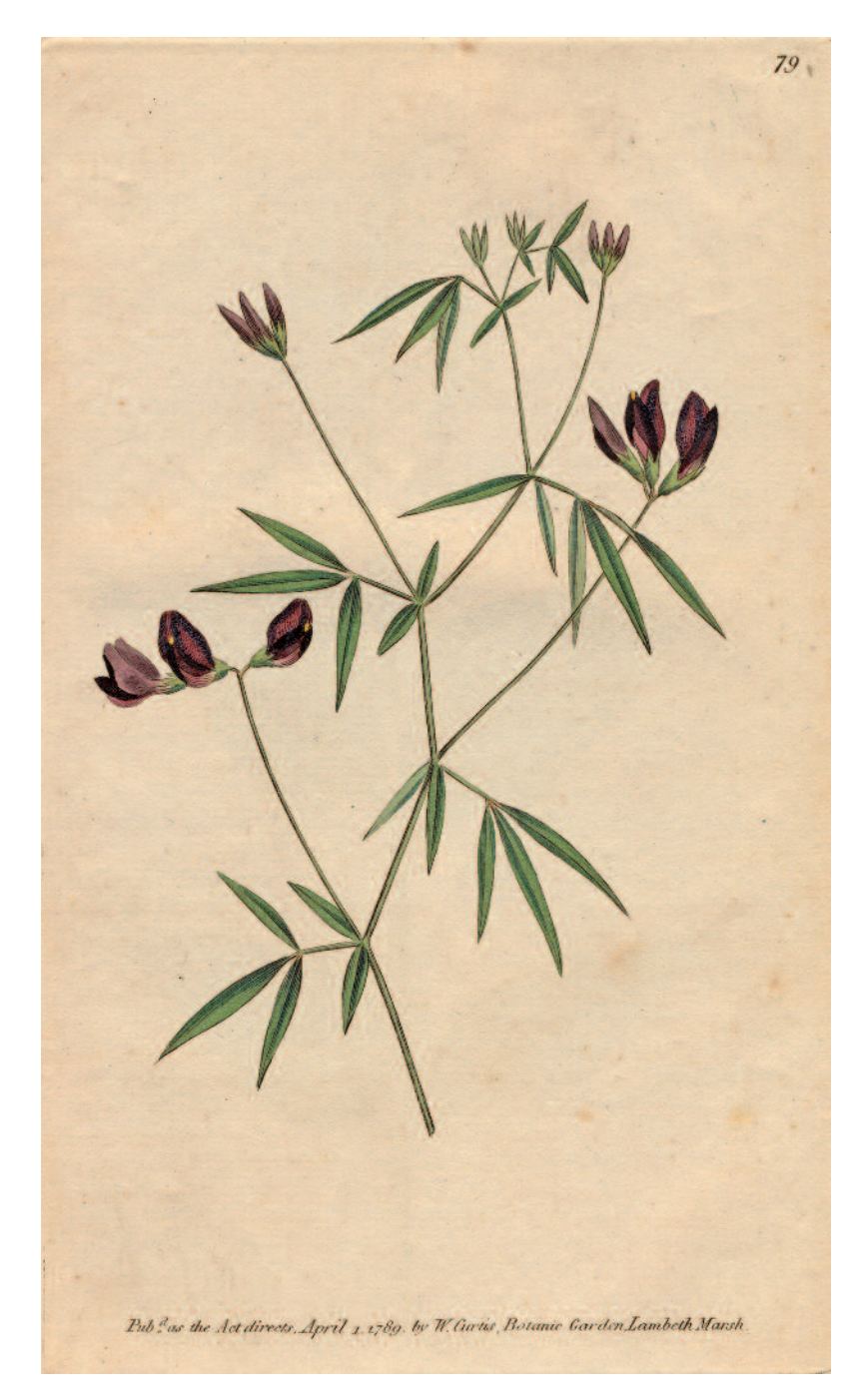
Figure 4.- Coloured engraving of the Cape Verdean endemic Lotus jacobaeus L. (Fabaceae) published by Curtis (1790b). Unknown author.