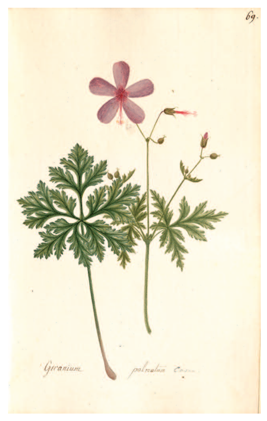
Figure 12.- Watercolour of the Madeiran endemic Geranium palmatum Cav. (Geraniaceae) by Johann Wendland found in his unpublished manuscript (Wendland, 1789).