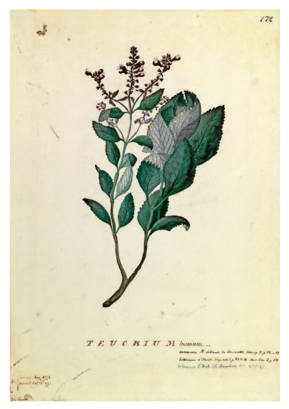
Figure 17.- Watercolour of the Madeiran endemic Teucrium betonicum L'Hér. (Lamiaceae) made by George Forster (sketched on August, 1772, painted on February 28, 1773), based on material found in Madeira during the second voyage of Captain Cook.