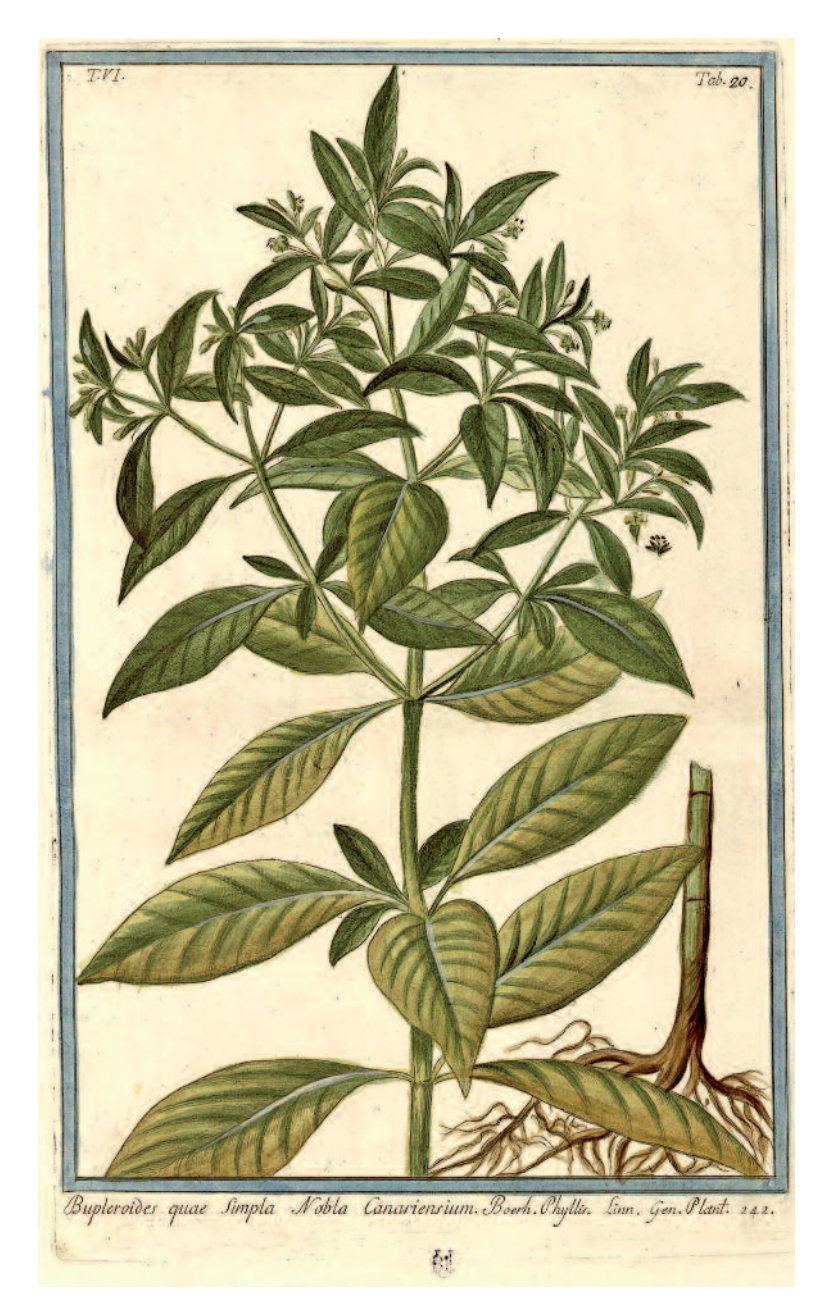
Figure 16.- Coloured engraving of the Macaronesian endemic Phyllis nobla L. (Rubiaceae) published by Bonelli (1780). Unknown author of drawing but engraving was likely executed by Magdalena Bouchard and likely painted by Cesare Ubertini, but see Stevenson (1961: 361) for details regarding authorship of Hortus Romancus illustrations.