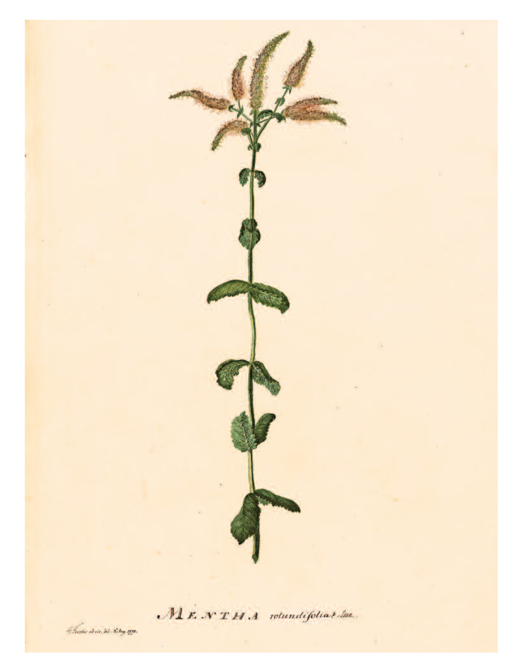
Figure 15.- Watercolour of the Madeiran native Mentha suaveolens Ehrh. (Lamiaceae) made by George Forster (sketched on August 3, 1772, painted on February 28, 1773), based on material found in Madeira during the second voyage of Captain Cook. Image copyright of the Gotha Library, University of Erfurt, Turingia, Germany.