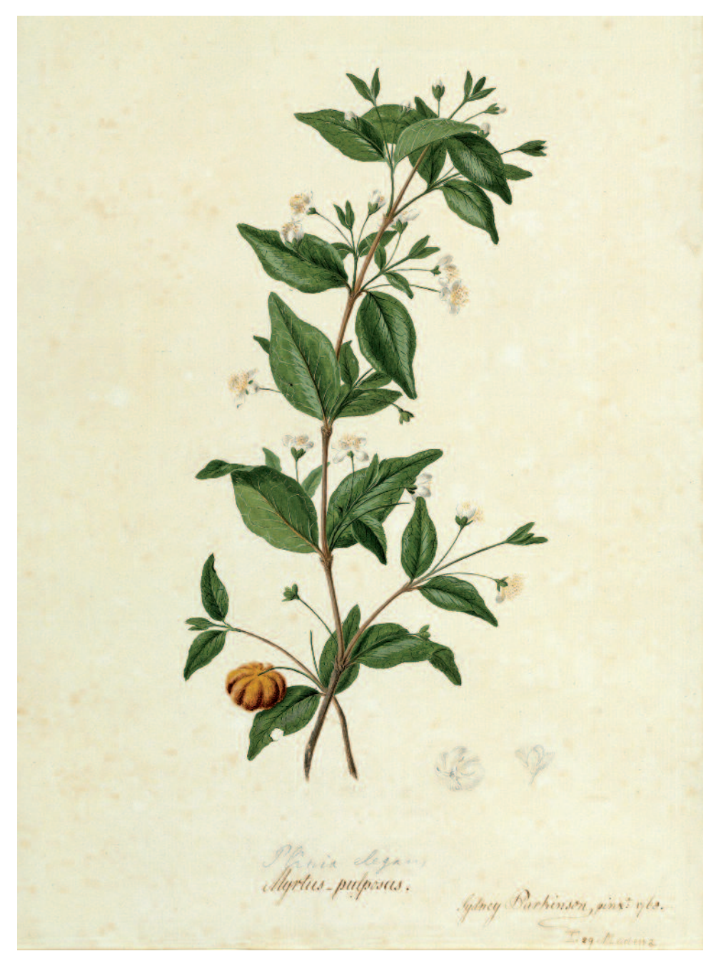
Figure 9.- Watercolour of the cultivated Eugenia uniflora L. (Myrtaceae) made by Sydney Parkinson in 1768, based on material found in Madeira during the first voyage of Captain Cook.