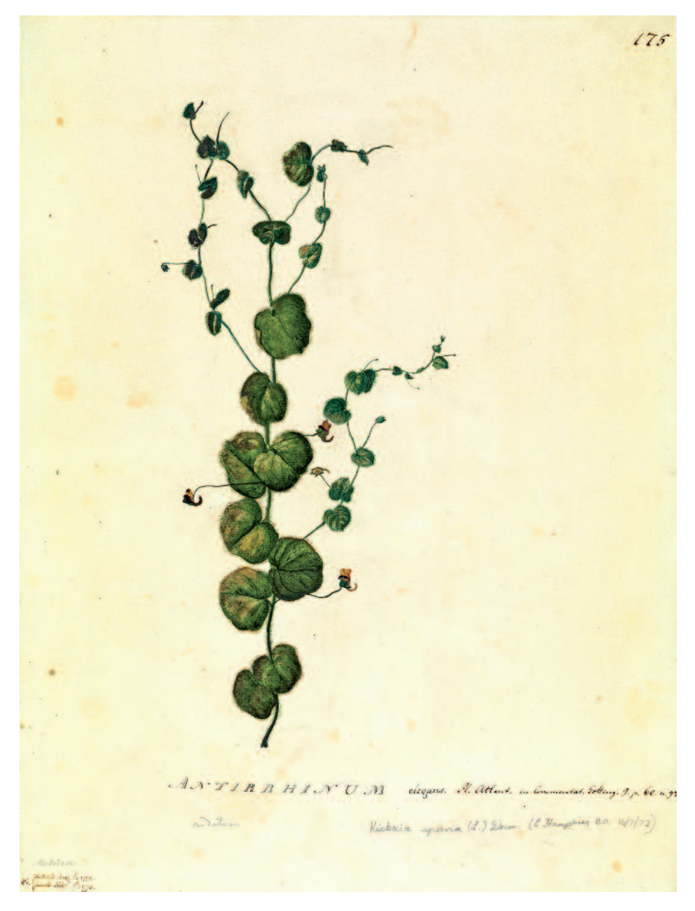
Figure 14.- Watercolour of the Madeiran native Kickxia spuria (L.) Dumort. ssp. integrifolia (Brot.) R. Fern (Scrophulariaceae) made by George Forster (sketched on August 2, 1772, painted on February 17, 1773), based on material found in Madeira during the second voyage of Captain Cook. Forster's label of this painting mistakenly assigned this species to the Cape Verde Island endemic K. elegans (G. Forst.) D. A. Sutton.