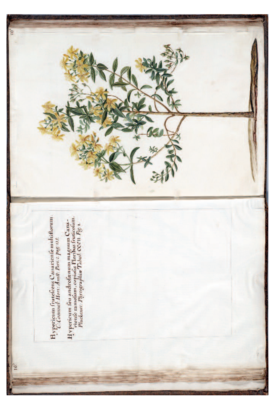
Figure 13.- Watercolour of the Macaronesian endemic Hypericum canariense L. (Hypericaceae) located at the Moninckx Atlas (vol. 4: [plate without number] 15) made by an unknown artist. Unknown date between 1686 and 1700.