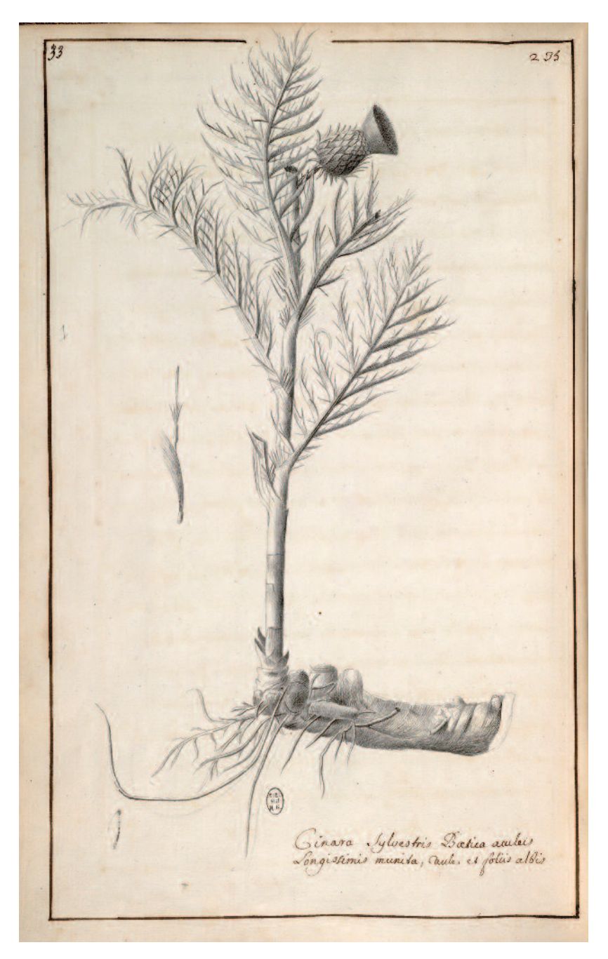
Figure 8.- Achromatic watercolour of the Canarian native Cynara cardunculus L. (Asteraceae) found in Feuillée's (1724) manuscript. (manuscript number 38).