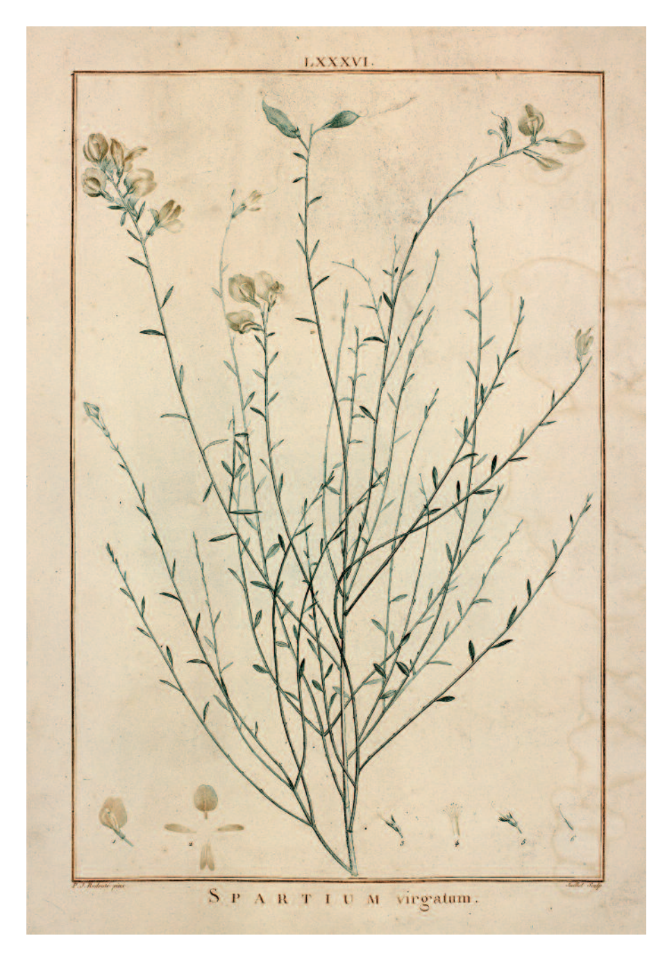
Figure 3.- Coloured engraving of the Madeiran endemic Genista tenera (Jacq. ex Murray) Kuntze (Fabaceae). Drawing made by Pierre-Joseph Redouté and engraving executed by Jacquaes Juillet (L'Héritier, 1805).