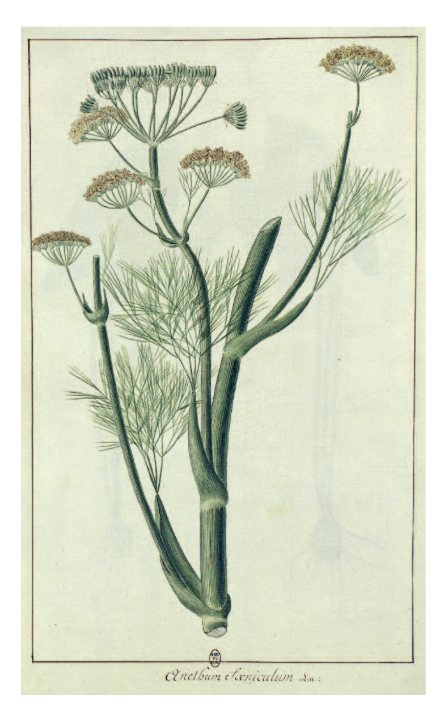
Figure 11.- Watercolour of the likely Canarian native Foeniculum vulgare Mill. (Apiaceae) found in Ledru's (1797) manuscript. Image copyright of the Natural History Museum of Paris (manuscript number 2547).