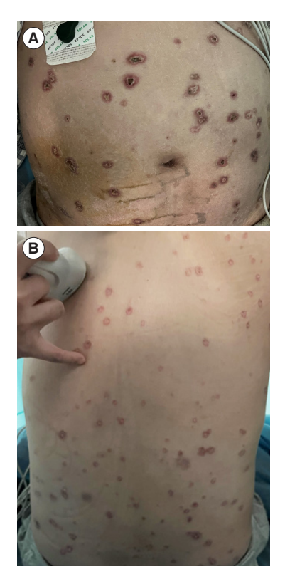
Fig. 1. Abdominal and back examination reveals skin lesions at various stages. (A) Anterior trunk. (B) Posterior trunk.

In compliance with her family's wishes, the patient was discharged home without exploratory laparotomy. She expired 2 days later.