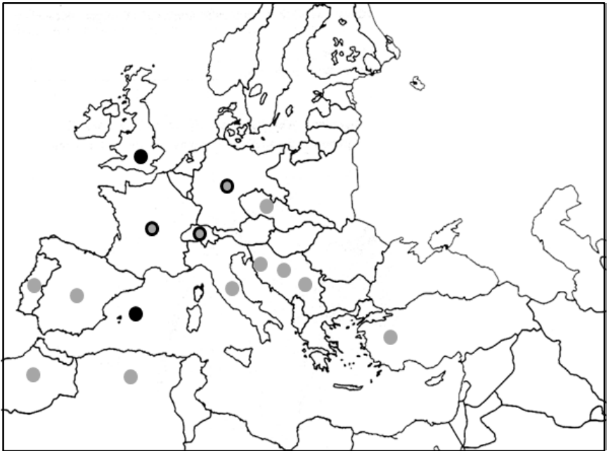
Fig. 2 Current known distribution of Anthrenus angustefasciatus . ● = data from Kadej et al. (2007), ● = data published since Kadej et al. (2007), ● = additions from the current study.

The National Dermestidae Recording Scheme is run through Biological Sciences at the University of Reading. Records should be submitted via iRecord with attached images for verification but GJH would be very happy to assist with identification of