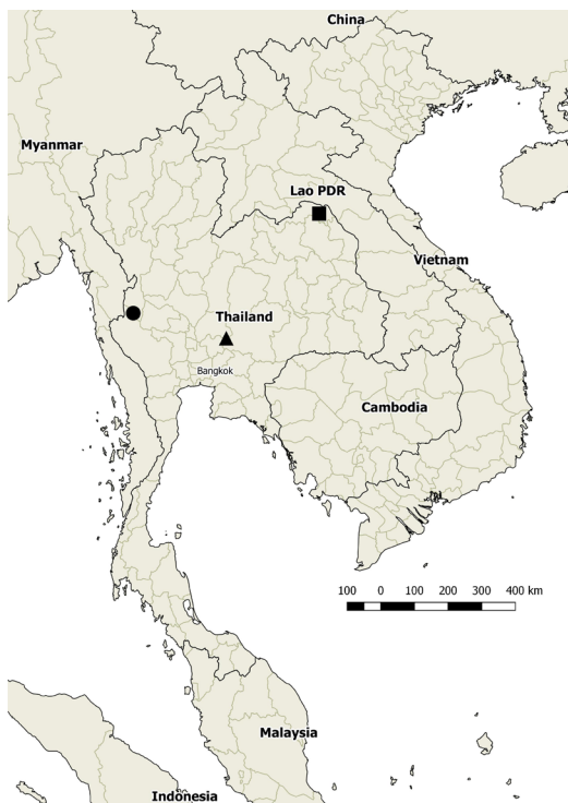
Figure 5. Distributions of Millettia phuwuaensis (closed square), M. pyrrhocarpa (closed triangle) and M. suddeei (closed circle). The map was created using QGIS version 2.14.1-Essen (QGIS Development Team, 2016).