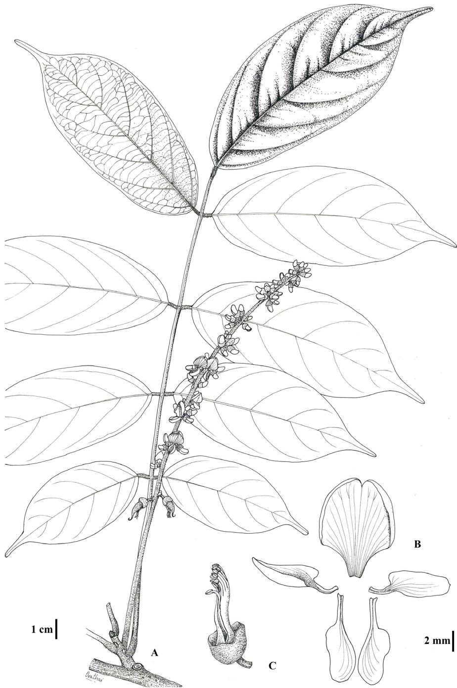
Figure 3. Millettia suddeei : A. Leaves & Inflorescence; B. Component of the flowers, composed of standard (upper), wings (lateral) and keel petals (lower); C. Stamens (drawn from Suddee et al. 5206). Illustrations by Orathai Kerdkaw.