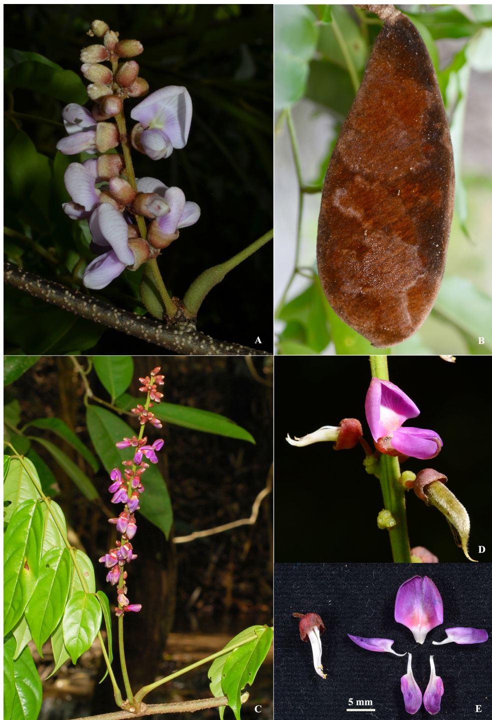
Figure 4. A–B: Millettia pyrrhocarpa : A. Inflorescence; B. Fruit. C–E: M. suddeei : C. Leaves and inflorescence; D. Part of the inflorescence; E. Papilionaceous flower (Right) and stamens (Left).