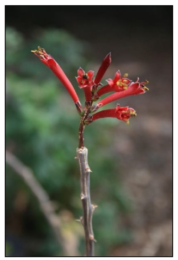
Fouquieria leonilae flower

FOUQUIERIA LEONILAE This dainty species is one of the most rare of all the Fouquieria. It is distinguished from the other species by being relatively thin branched and lightly spined in most clones.