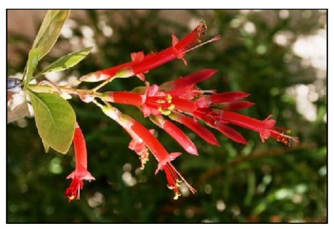
Fouquieria formosa flower

The most unique aspect of this species has been that it literally has thrived in our coldest winters. That's not to say it is found in colder temps in Mexico, as it isn't. I don't know why this is the case, but my F. formosa go through their most significant growth spurts in early spring, immediately following our coldest winters (2007 and 2011 winters caused the most growth in my plants!).