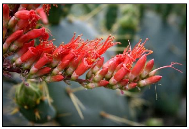
Fouquieria splendens flower

FOUQUIERIA SPLENDENS Lastly, this is the species that most of us are familiar with. Along with F. shrevei , it is also the only one with a candelabra form growth pattern (as opposed to a tree or bush form). It is extremely easy to find and add to your landscape as both large and small specimens. It is very cold hardy (down to 18F at least), and can bloom in almost any month of the year. The only negatives for the species are that they do