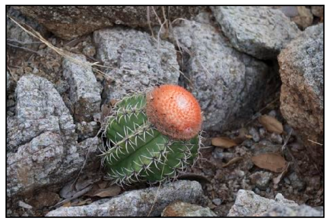
Melocactus matanzanus is endemic to Cuba and only known from one small group of populations in northern Cuba. It is a species threatened by overcollecting by hobbyists.