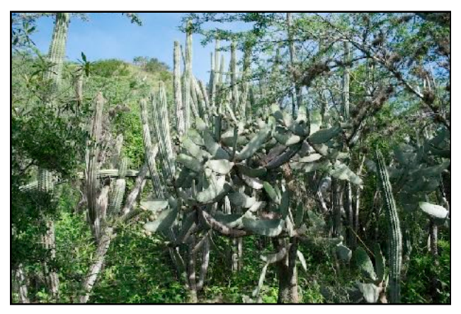
This is the seasonally tropical dry forest in the Sierra Martín García, Dominican Republic. Both Consolea moniliformis (front) and Stenocereus fimbriatus (back) are common species found in these areas throughout Hispaniola.