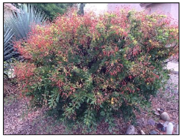
Fouquieria macdougalii (see cover photo)

Next to the native species, this has got to be the easiest of all the ocotillos to grow in the Valley. To top it off, they bloom at a very small size (one foot), and bloom freely- even in containers.