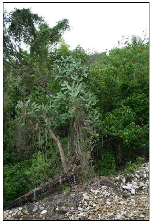
Consolea picardae from around 900m elevation in the Sierra.