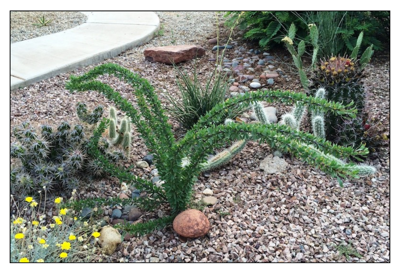
Fouquieria splendens ssp campanulata var albiflora

try to spy one that is a different species than what you are used to. Your searches will be worth it. Fouquieria are some of the most rewarding plants to grow!