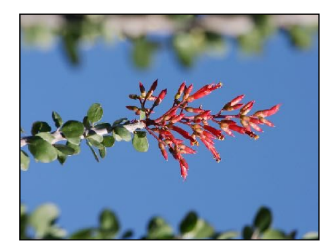
Fouquieria diguetii flower

The flowers on this species are similar to our native ocotillo, but the flowering panicles are a bit more open and the petals are not reflexed at anthesis. The flowers are very similar to the flowers of closely related F. macdougalii , but the latter's flowering panicles are even more open.