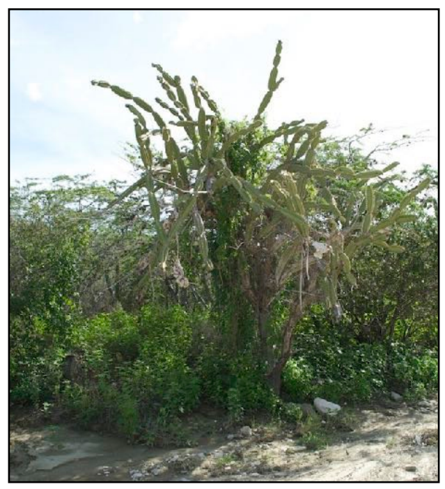
Leptocereus paniculatus is an arborescent species common in the Hispaniola tropical dry forest. It is commonly harvested for its wood for use in furniture building.