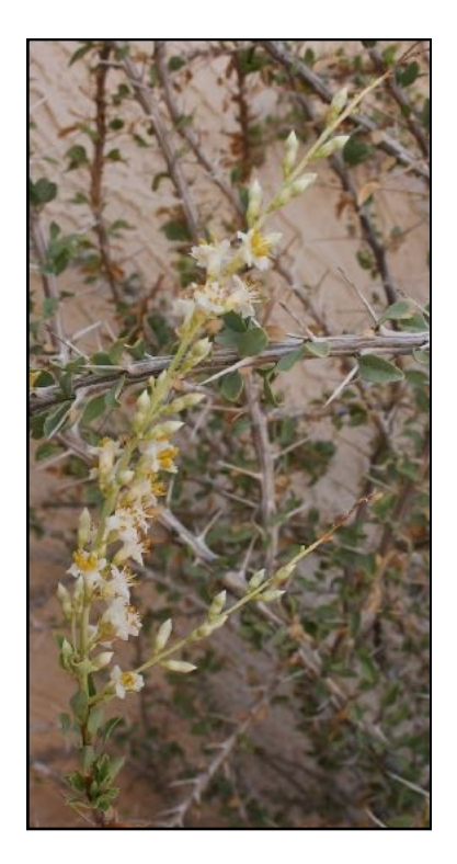
Fouquieria burragei with white flowers.

FOUQUIERIA BURRAGEI This gorgeous species is easily distinguished from others in the genus by vegetative features in addition to floral features. The leaves on this species have a bluish-gray hue that is unique in the genus. Additionally, the flowers range anywhere from deep pink to pure white, though