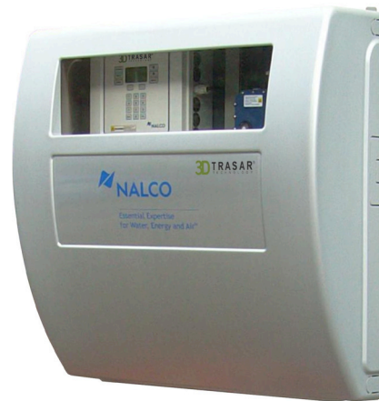
3D TRASAR control system

The 3D TRASAR cooling water management programme delivers on-demand control and optimisation of cooling water chemistry and microbiology, continuously protecting the system from corrosion, scale formation, and microbial infection