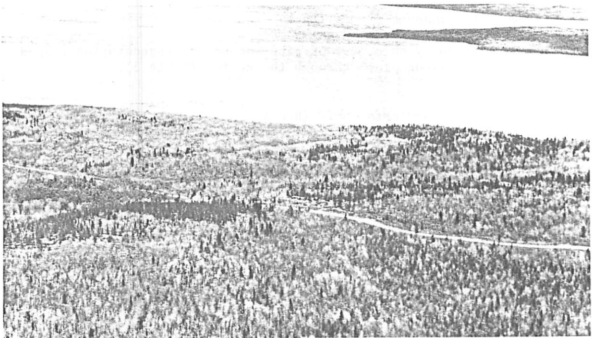
Fig. 2. Extensive defoliation by the forest tent caterpillar as observed in late June.