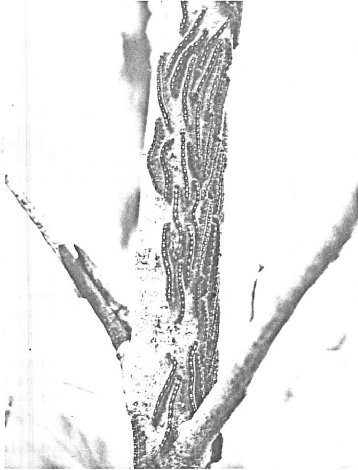
Fig. 1. Full-grown larvae of the forest tent caterpillar, a defoliator of trembling aspen.