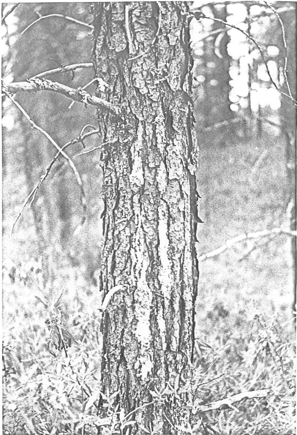
Frontispiece. Fruiting of Cronartium comptoniae Arth. and canker on the bole of a jack pine tree.