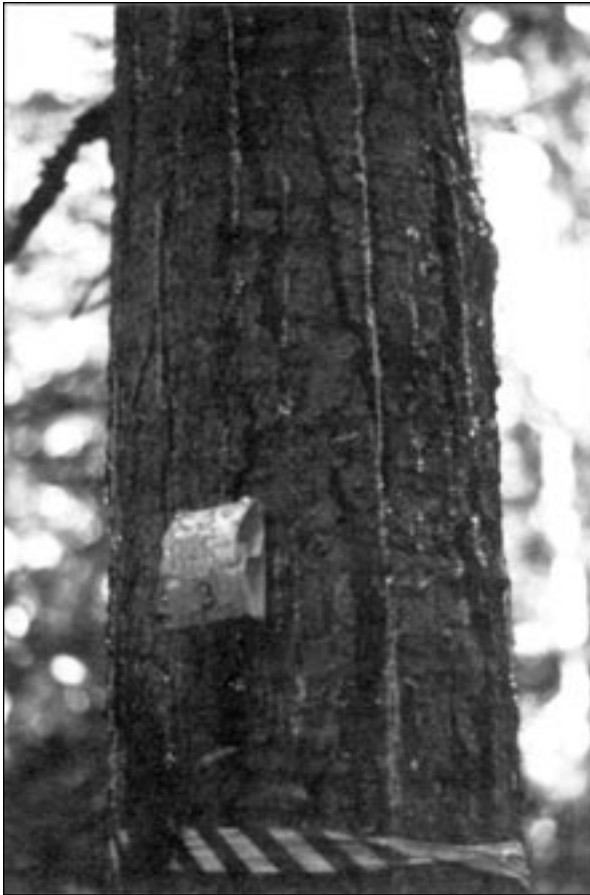
Resin flow down outer bark of a pheromone-baited tree following attack by the balsam bark beetle