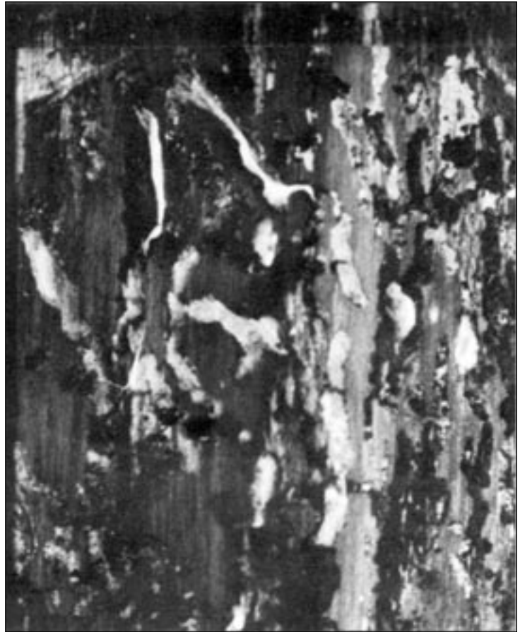
Balsam bark beetle galleries and development of fungal mycelium two years after initial attack