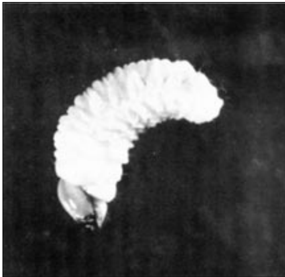
Western balsam bark beetle larva