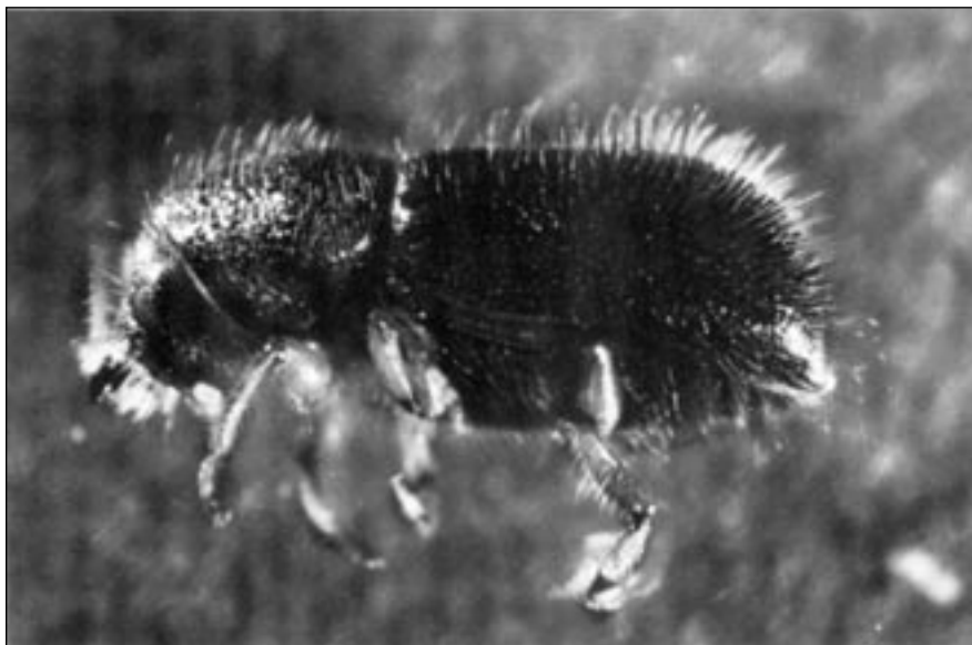
Western balsam bark beetle pupa

Although occasionally D. confusus infestations can kill high numbers of trees in a stand in a single season, successive years of aerial mapping surveys have shown that, more frequently, less than 5% of a stand is attacked in any one year. High beetle populations can persist within a stand for many years until all of the mature and semi-mature alpine fir have been killed.