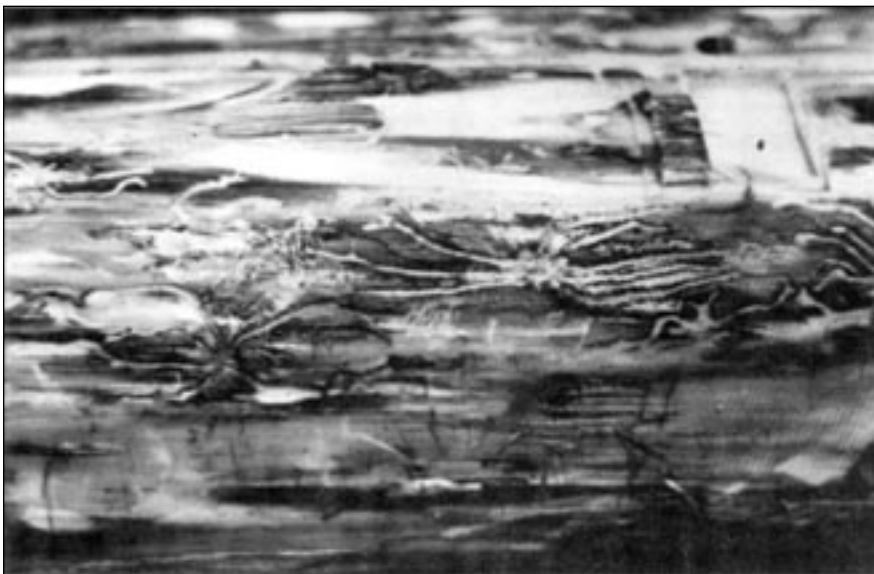
Galleries formed by the western balsam bark beetle