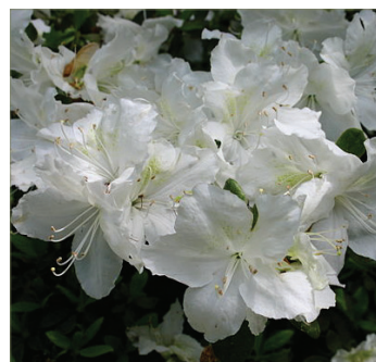
Rhododendron 'Delaware Valley White'