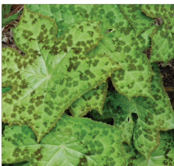
Podophyllum 'Spotty Dotty'