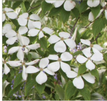
Cornus x rutgersensis [Celestial] = 'Rutdan'