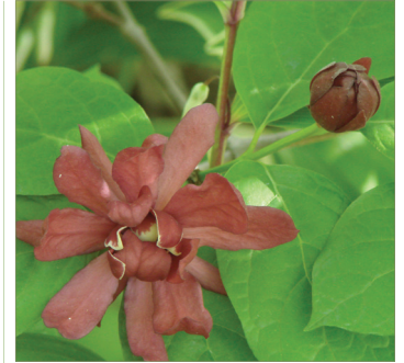
Calycanthus x raulstonii 'Hartlage Wine'