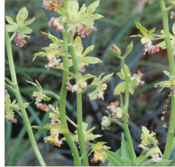
Calanthe spp. and hybrids