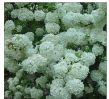
Viburnum macrocephalum f. macrocephalum