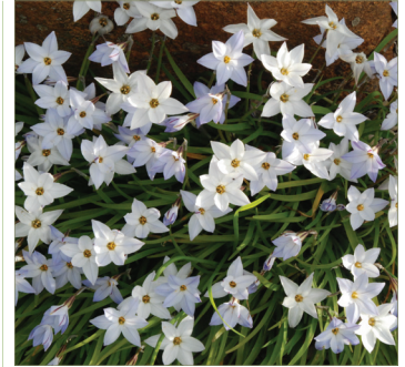
Ipheion uniflorum 'White Star'