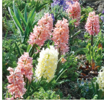
Hyacinthus orientalis 'Yellowstone' and 'Gypsy Queen'