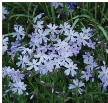
Phlox subulata 'Emerald Blue'