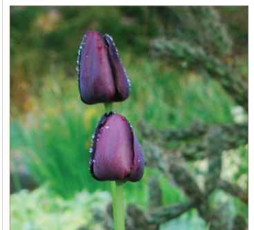
Tulipa 'Queen of the Night'