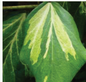
Hedera colchica 'Sulphur Heart'