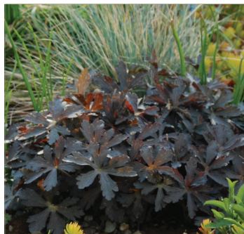
Geranium maculatum 'Espresso'