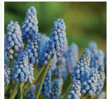
Muscari armeniacum 'Valerie Finnis'