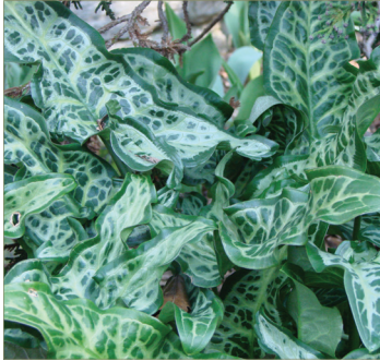
Arum italicum subsp. italicum 'Czech types'