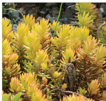
Sedum rupestre 'Angelina'