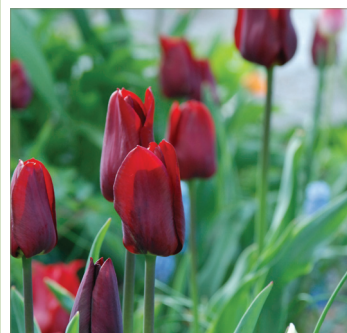
Tulipa 'National Velvet'