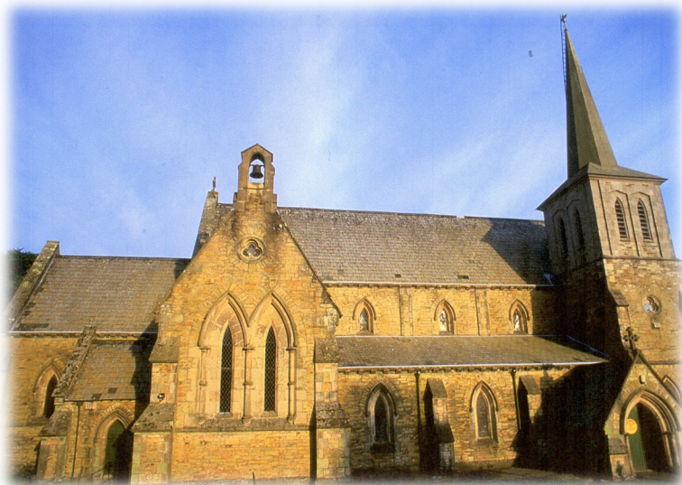
Sunlight highlights the mudstone on the north elevation of St. Pauls Church, Charlestown (3)

Another interesting stone used in the Church is “Duporth Stone”, which is similar to the better known “Polyphant Stone” from near Launceston. This comes from the small headland within Duporth Bay. It forms the dark green panels on the Rood Wall between the Chancel and the Nave. It was also used for some of the columns forming the pillars of Truro Cathedral.