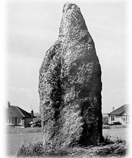
The Longstone on Gwallon Downs (4)