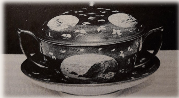
The last known image of The Duport Cup from the 1980s (5)

When we previously left the search for The Duport Cup, a late c.18 th , unique, ceramic item with great significance to the early history of the port of Charlestown in Cornwall, doubts had been raised about the cup's date and even whether, as was originally thought, it had been made by Wedgwood.