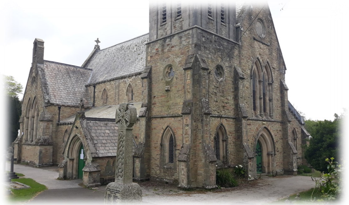
The War Memorial and north-west sides of the Church (2)

Several interesting stones have been used in the construction of Charlestown Parish Church. The surrounds to the windows and doors and the quoins are made of a fine grained granite which came from a quarry beside the B3274 between Stenalees and Hensbarrow. It is similar to “St Stephen’s Stone” which is a kind of pale coloured granite which has been used in churches all over Cornwall. The medieval St Piran’s Church in Perran Dunes used St Stephens stone and the interior of the Cathedral is lined with St Stephen’s stone, partly because it is so light in colour. However, the granite from Hensbarrow is slightly different, as it contains veins of turquoise, a patch of which can be seen in the exterior tracery of the east window of the Chancel. This granite has also been used in the past as an ingredient in ceramics as a kind of china stone, because of its very low iron content, but nowadays interest is more focused on the fact that this granite has the distinction of having the highest lithium content of any granite in SW England, mostly contained in the mineral zinnwaldite. With increasing demand for Li-ion batteries for electric cars, as well as many other electronic devices, there is much interest at the moment in using this type of granite as a source of lithium. The granite is weakly altered to china clay; the church cleaners know this all too well, as they often find dust from the disintegrating granite around the pillars, pulpit etc.