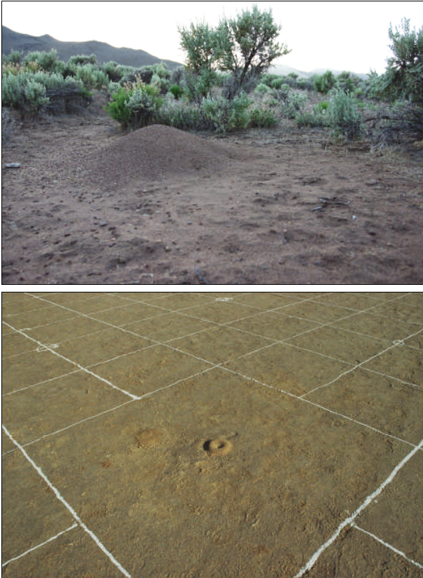
Fig. 2: Ants encounter the problem of orienting in a complex environment particularly during foraging trips. The challenges faced by the ants, and the possible solutions, however vary enormously with the habitat: some habitats may lend themselves to using landmarks or patterns on the horizon for orientation, whereas some desert ants rely more on path integration because of the lack of landmarks.

& JOHNSON 1966, FRISCH 1967). Knowledge about food source attributes also modulates other behaviours: if learned visual stimuli are not sufficient to discriminate food sources, honey bees deposit additional scent marks to guide them (GIURFA & al. 1994). Both bees and wasps may also perform "learning flights" around new food sources or around a familiar site if landmarks have changed (LEHRER 1996, WEI & al. 2002), indicating that in this context, bees "know what they know", and actively seek to learn more if necessary (WEI & al. 2002). Bees can also use prior knowledge about which stimuli they are likely to encounter to recognise poorly visible or camouflaged objects (ZHANG & SRINIVASAN 1994).