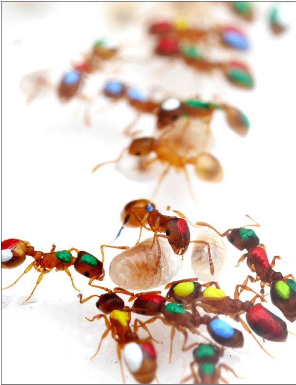
Fig. 1: Individual labelling of ants, usually with paint marks, is crucial for discovery of individual cognitive skills (shown here: Temnothorax rugatulus , photograph by Alex Wild ©).

GERBER & al. 2004b, MEHREN & al. 2004, SRINIVASAN & ZHANG 2004, ROBINSON & al. 2005, GRONENBERG 2008), although we are still far from mapping a complete neural circuit for any moderately complex behaviour. Second, the immense number of insect species allows comparative studies to link cognitive abilities to ecology, and thus quantify the fitness benefits of cognitive skills such as information processing and learning (CHITTKA & al. 2004, RAINE & al. 2006a, RAINE & CHITTKA 2007b). In addition, researchers are beginning to investigate costs as well as benefits of cognition-related genes (MERY & KAWECKI 2003, CHITTKA & al. 2004, MERY & KAWECKI 2004). Eventually, a more thorough understanding of benefits as well as costs of cognitive skills should enable us to understand how and why a diversity of such skills has evolved in animals.