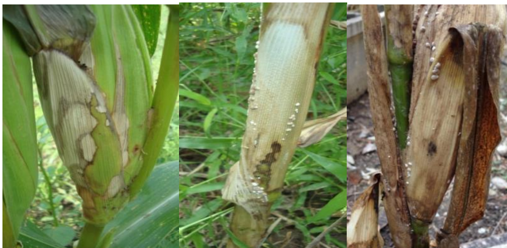
Figure 1 Maize plants showing typical symptoms of Banded Leaf and Sheath blight Disease under field conditions

The BLSB diseased specimens were collected from the field then thoroughly washed in tap water ( Figure 1 ). Small sections of 5 mm pieces from an advancing BLSB lesion on each diseased sample were cut and surface sterilized by dipping in 5% sodium hypochloride solution for about 1-2minutes, followed by rinsing 3 times in sterilized distilled water (SDW). The leaf pieces were later placed on sterile filter paper until excess moisture was absorbed and then transferred aseptically onto Petri dishes containing Potato Dextrose Agar (PDA) and incubated at 27 \pm 2^\circ \text{C} . The incubated Petri dishes were monitored daily for fungal growth. The visibly grown colonies were later purified by single hyphal tip method [10] and then transferred onto PDA slants, and maintained by periodical sub-culturing ( Figure 2 ).