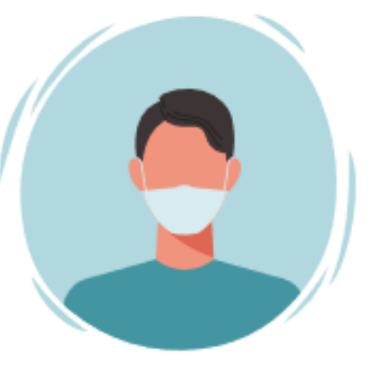
Wear a mask

Even after vaccination, it is still important to continue preventative measures. Continue to follow guidelines and honor each location's COVID-19 policies.