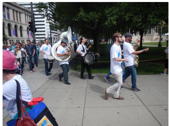
Celebrating Dame Myra Hess Concert series with a parade

The Chicago Cultural Center at Washington & Michigan has hosted the Dame Myra Hess Memorial Concert series, free, every Wednesday at lunchtime since 1977. To mark their 40 th anniversary, they plan a concert October 18 in Preston Bradley Hall featuring the Vermeer Quartet and the Arianna Quartet. Arrive early to get a seat! Did I say that this concert is free? And you can take the L there, that's almost free. Leave the car at home, and practice your recorder while you ride the CTA.