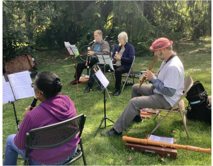
Members and friends of the West Suburban Early Music Society jamming outdoors, September 13, Downers Grove