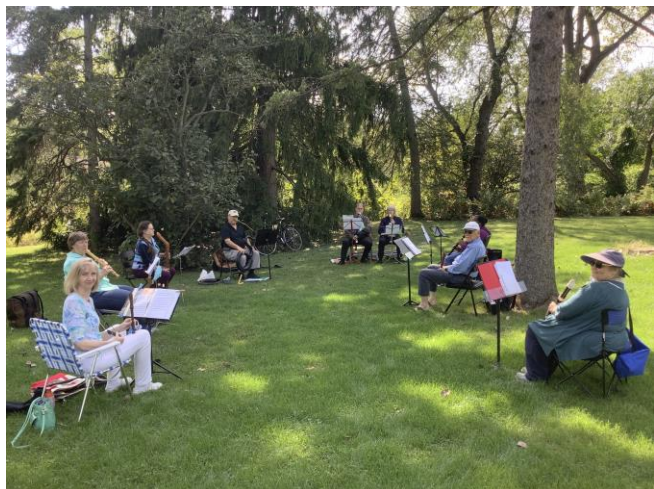
First meeting for 2020-2021, West Suburban Early Music Society, Sunday September 13