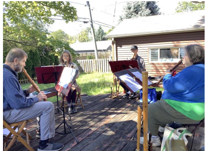
More outdoor jamming, September 19 in Lyons