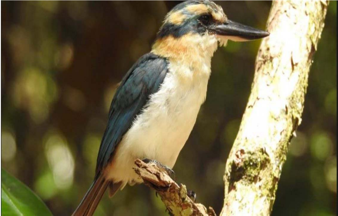
Tanga'eo (Mangaia Kingfisher)