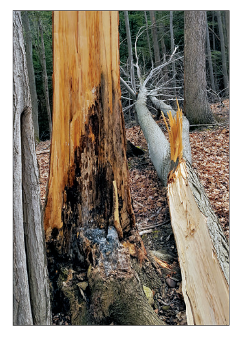
Photograph 3. Kretzschmaria deusta-infected tree that failed. It is the same tree depicted in Photograph 2. The tree was also infected with Armillaria sp. that also likely contributed to the failure.

Two spore stages of the fungus are produced, and this can confuse identification. The "imperfect" or asexual spore stage is