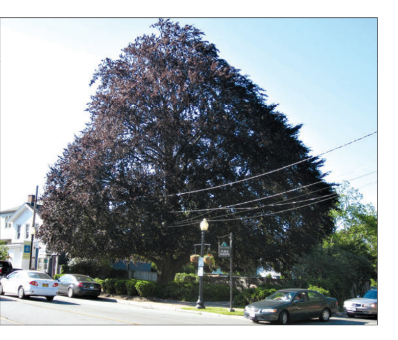
Photograph 9. A purple leaf European beech infected with Kretzschmaria deusta that is showing no crown symptoms despite an advancing infection, as depicted in Photograph 5.