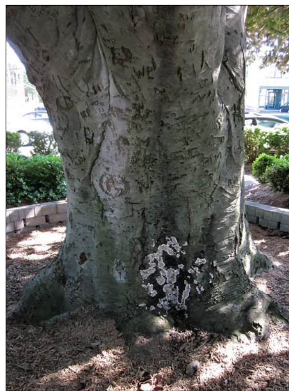
Photograph 5. The white to gray imperfect or asexual stage of Kretzschmaria deusta on a European beech. Note that the tree is also showing symptoms of Phytophthora bleeding canker.

K. deusta has a wide host range but is most common on sugar and other maples, European linden, European beech, hicko-