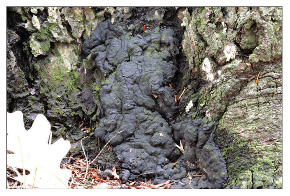
Photograph 4. Stroma or fungal material of the pathogen on a hickory (despite the oak leaf in the image). The sexual spore stage is imbedded in this material, which is dry and crumbly when it is removed from the tree.

often seen in the spring when the stroma is initially developing. This stage forms a white to gray layer on top of the developing black stromatic tissue (Photograph 5). The thickness of the black, crusty fungal tissue associated with the perfect stage increases during the growing season (Photograph 4). The black crust persists and can be found at most times of the year, while