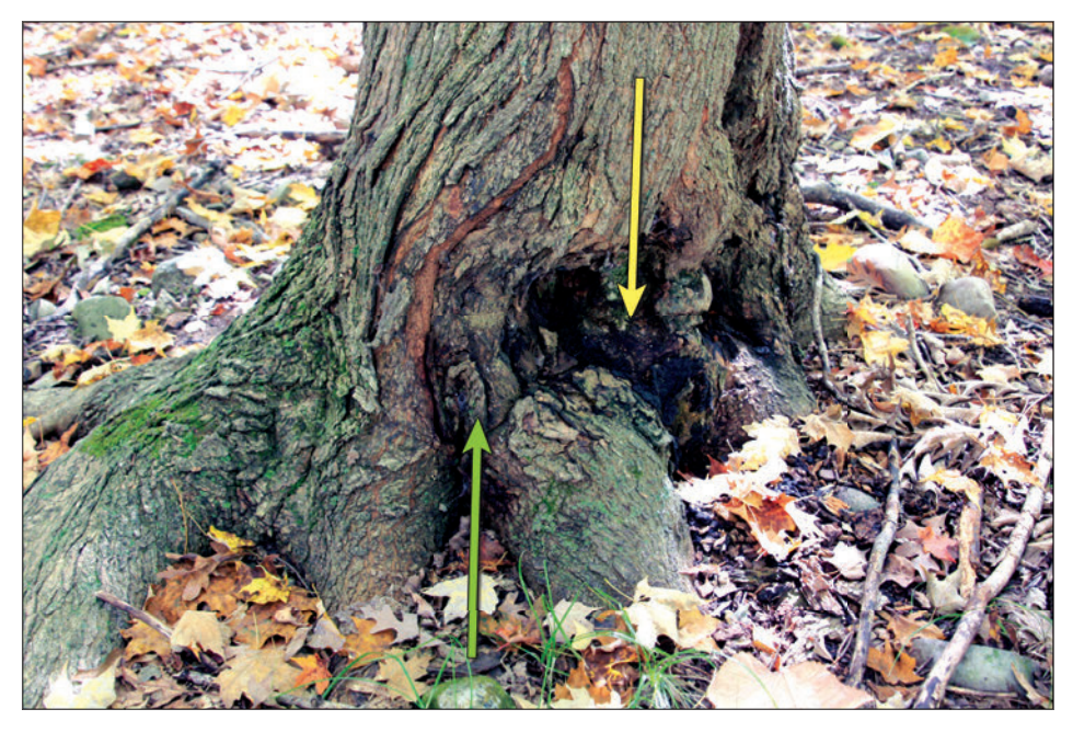
Photograph 2. A sugar maple infected with Kretzschmaria deusta. Note the black crusty material in the butt and roots in the center of the image (yellow arrow) and the multiple rolls of wound wood that have been killed by the fungus (green arrow).

range, can aggressively attack weakened trees. It also can kill living tissues in the bark and sapwood in trunks and roots, and