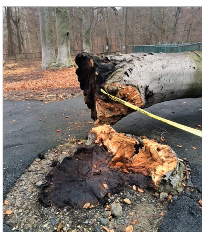
Photograph 7. A European beech that snapped off at ground level due to at least partial infection by Kretzschmaria deusta

The decay caused by K. deusta is somewhat unique in that the fungus creates holes in cell walls by degrading cellulose. This degradation reduces the tensile strength of wood and leaves the wood brittle. Seriously infected trees often snap off at roots or near ground level without the formation of significant hollows (Pho-