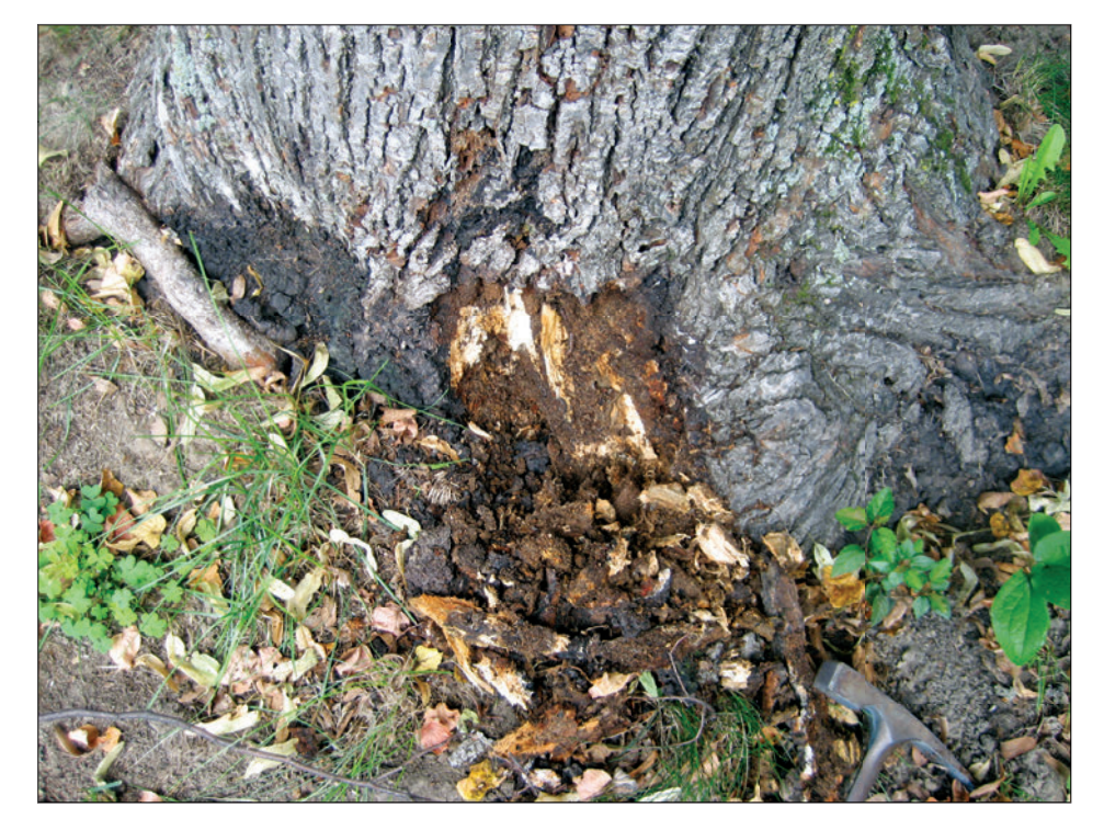
Photograph 6. Kretzschmaria deusta is also a canker pathogen in that it can kill bark and cambium in addition to decaying wood. Note discolored sapwood beneath after the fruiting and bark was removed. See Photograph 1 for the appearance of the bark before it was removed.

ry, hackberry, sycamore and elm. It is less common on oaks, but this is a reported host in the literature. Hackberry infected with the fungus should almost always be removed as soon as possible, as this tree species has shown little resistance to rapid killing and decay of roots, particularly in southern states.