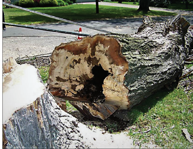
Photograph 10. Hinge wood on this large sugar maple did not hold as desired, because the wood had been decayed by Kretzschmaria deusta.

es infected with Phytophthora bleeding canker have not produced an observable reduction in subsequent disease spread.