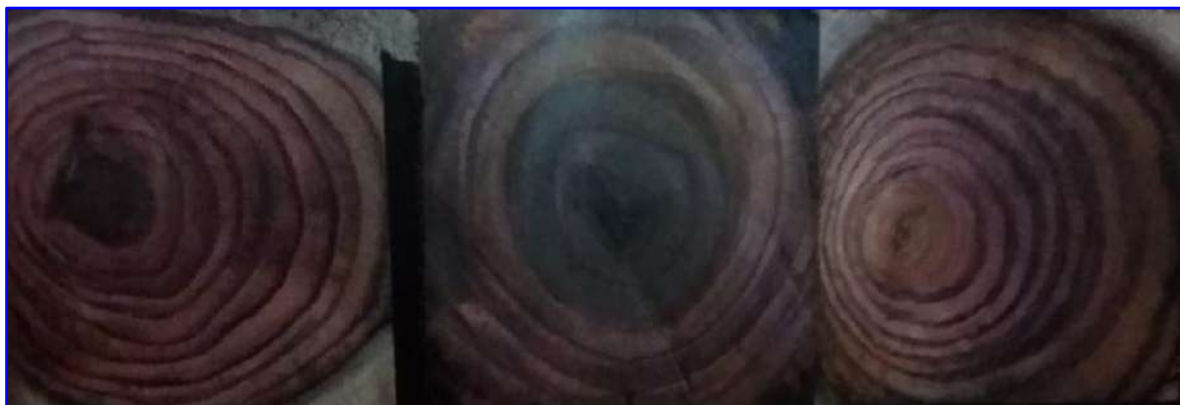
Figure 1. Cross sectional trunk of D. latifolia from a population from Java (after Yulita and Susila 2019 unpublished).

Dalbergia latifolia Roxb. (Fabaceae) is known as sonokeling in Indonesia. The species may not native to Indonesia but have been naturalised in several islands of Indonesia since it was introduced from India (Sunarno 1996; Maridi et al. 2014; Arisoesilaningsih and Soejono 2015; Adema et al. 2016;). The species has beautiful dark purple heartwood (Figure 1). The wood is extracted to be manufactured mainly for musical instrument (Karlinasari et al. 2010). At present, the species have been cultivated mainly in agroforestry (Hani and Suryanto 2014; Mulyana et al., 2017). The main distribution of species in Indonesia including Java and West Nusa Tenggara (Djajanti 2006; Maridi et al. 2014; Arisoesilaningsih and Soejono 2015; Yulita et al. 2020).