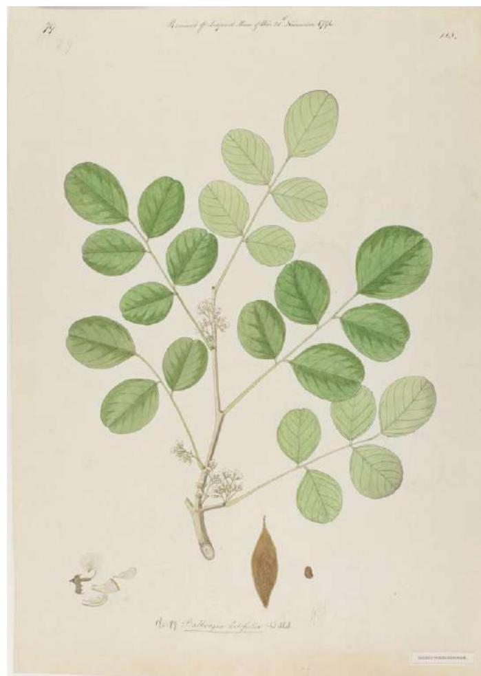
Figure 2. Watercolour illustration of D. latifolia ( http://www.plantsoftheworldonline.org/taxon/urn:lsid:ipni.org:names:490294-1 )

becoming flaking; crown rounded to dome-shaped" (Soerianegara and Lemmens 1993; Lemmens 2008). Leaves arranged spirally, imparipinnately compound with (3–)5–7(–9) leaflets (Figure 2); stipules small, caducous; petiole and rachis glabrous; petiolules up to 1 cm long; leaflets alternate, broadly obovate to elliptical-oblong, 4–12 cm × 2.5–9 cm, obtuse, rounded or notched at apex (Figure 2), papery or thinly leathery, glabrous" (Soerianegara and Lemmens 1993; Lemmens 2008). Inflorescence located at terminal or axillary, the panicle 5–15 cm long, laxly branched, almost glabrous, many-flowered" (Soerianegara and Lemmens 1993; Lemmens 2008).