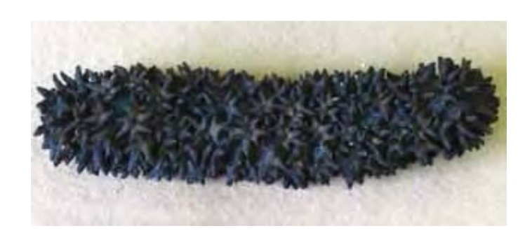
T. ananas (processed)

T. anax is also large, with an average length of 63 cm but a maximum length of 89 cm (Purcell et al., 2012). Its colour varies from creamy white beige to grey or light brown with dark brown and/or reddish spots and blotches dorsally. Those in the Indian Ocean may lack the reddish blotches.