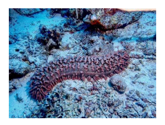
T. ananas (live)