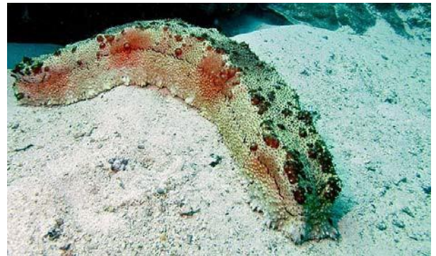
T. anax (live)

In its dried form, T. anax is 15-20 cm long, relatively elongate with a squarish cross-section, and brown in color. The dorsal surface is rough and covered with wart-like bumps. The ventral surface is grainy (Purcell et al., 2012).