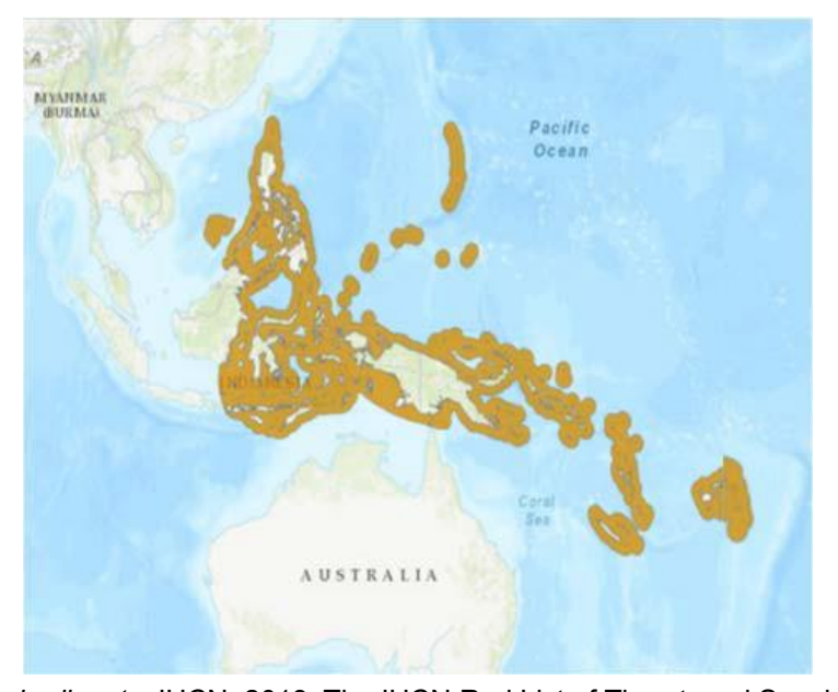
Distribution of T. rubralineata , IUCN, 2013. The IUCN Red List of Threatened Species. Version 2020-2

Thelenota rubralineata is found only in the east Pacific; it has not been identified in the Indian Ocean(Kinch., 2005; Lane, 2008), unlike the other two Thelenota species. T. rubralineata 's range includes Australia, Mainland of aChina, Cook Islands, Fiji, Guam, Indonesia, Malaysia, Federated States of Micronesia, New Caledonia, Palau, Papua New Guinea, Philippines, Solomon Islands, the island of Taiwan, Timor-Leste, United States of America (Northern Mariana Islands) and Vanuatu (Conand et al., 2013b).