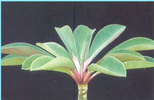
Retain E. bongolavaensis