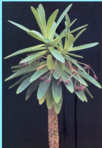
De-list E. bravoana