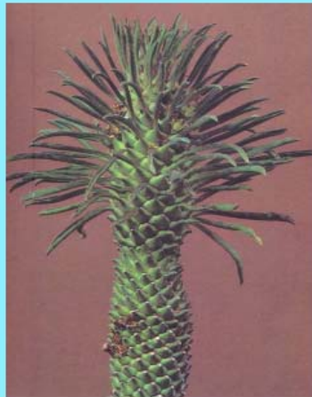
De-list E. clandestina