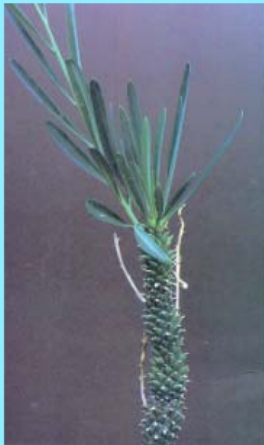
Retain E. monteroi