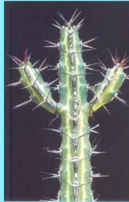
De-list E. serendipita