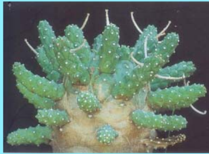
De-list E. fortuita