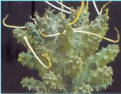
Retain E. crassipes