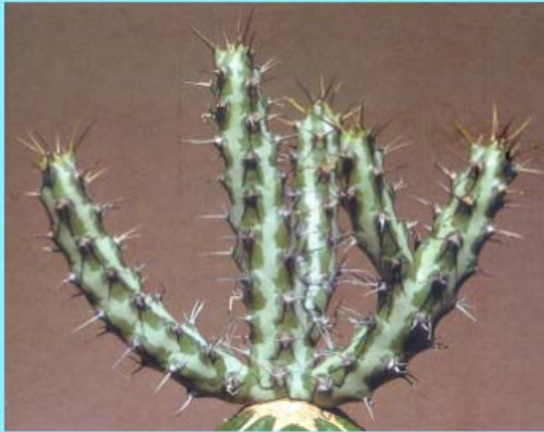
Retain E. horwoodii