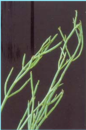
Retain E. burmannii