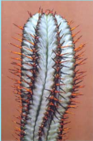
Retain E. inconstantia