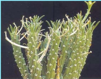
De-list E. maleolens