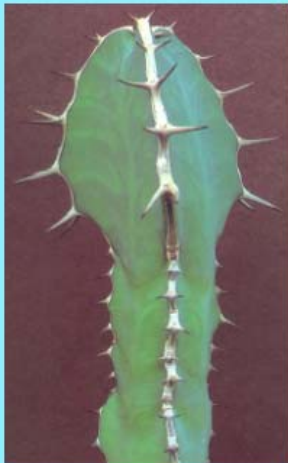
Retain E. cactus