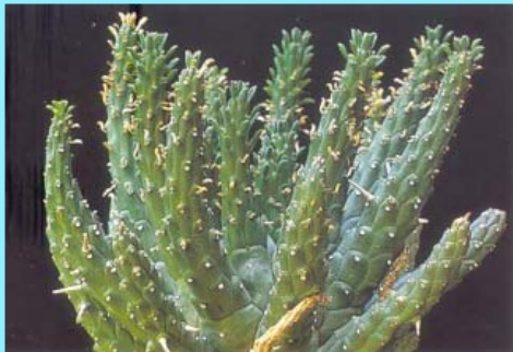
Retain E. fusca