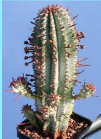
De-list E. submammilaris