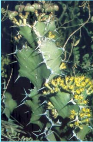
Retain E. cactus