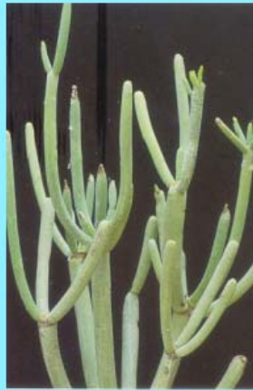
De-list E. aphylla