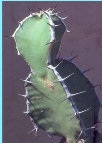
De-list E. strangulata