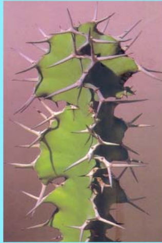
De-list E. grandicornis