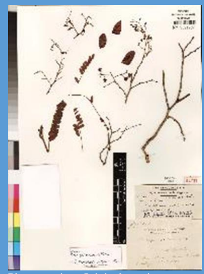
Photo caption: Original specimen housed in the Paris herbarium collected by H. Perrier de la Bâthie in 1903 in Mahajanga, Madagascar. This specimen was used to describe and recognize the species, Dalbergia tsiandalana (Viguier, 1951).