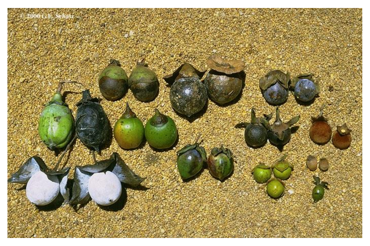
Figure 3. Twelve species of Diospyros fruiting simultaneously on Nosy Mangabe island in northeastern Madagascar, seven of which are new to science.

Authoritatively identified herbarium material provides information on the geographic distribution and commonness/rarity (number of documented localities) of Diospyros species in Madagascar. This information is available for all published species (including as on-line maps) through the Diospyros page on the Madagascar Catalogue (The Madagascar Catalogue, 2016). For species that remain to be formally named and described, data on geographic range have been compiled by the two specialists working on the genus (see Box 3 for more information on how species are formally named and described). Some species of potentially exploitable size that can reach 40-60 cm DBH are widespread, such as D. haplostylis , D. sakalavarum and D. tropophila , while others, including D. bemarivensis , D. antongilensis and D. taikintana (the latter two unpublished), have much more restricted ranges. Most Malagasy forests contain multiple species of Diospyros , almost always including some that have large enough trunks to produce commercially valuable wood. At least half of the co-occurring species shown in Figure 3 are large trees and Figure 4 shows an example of a potentially exploitable species in the wild.