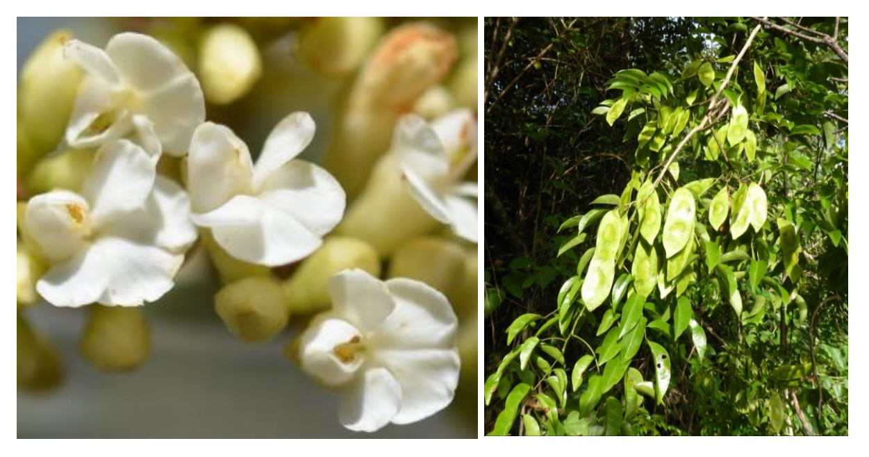
Figure 2. ( Left ) Flowers of Dalbergia monticola; ( Right ) Fruits of Dalbergia bracteolata.

in Madagascar, out of a worldwide total of 140 (250 total taxa when subspecies and varieties are included) (Bosser & Rabevohitra, 2002; Klitgaard & Lavin, 2005). The species of Dalbergia occurring in Madagascar can be distinguished from one another by characters of their flowers and fruits but even expert scientists are unable to tell species apart without these reproductive structures (i.e., when only leaves are available; see Figure 2 for examples of Dalbergia flowers and fruits). Moreover, recent studies involving DNA sequence data from field-collected material (Hassold et al., unpublished data) and careful examination of herbarium specimens (Phillipson et al., unpublished data) have shown that some of the species defined in the most recent taxonomic treatment of the genus in Madagascar (Bosser & Rabevohitra, 2002) appear to represent several distinct entities and that at least some of the subspecies and varieties they described should be recognized as separate species (see Box 4 for a description on how plant species are formally named and described). Wood features are helpful for recognizing some species or species and on commercial export permits are frequently incorrect or wrongly assigned.