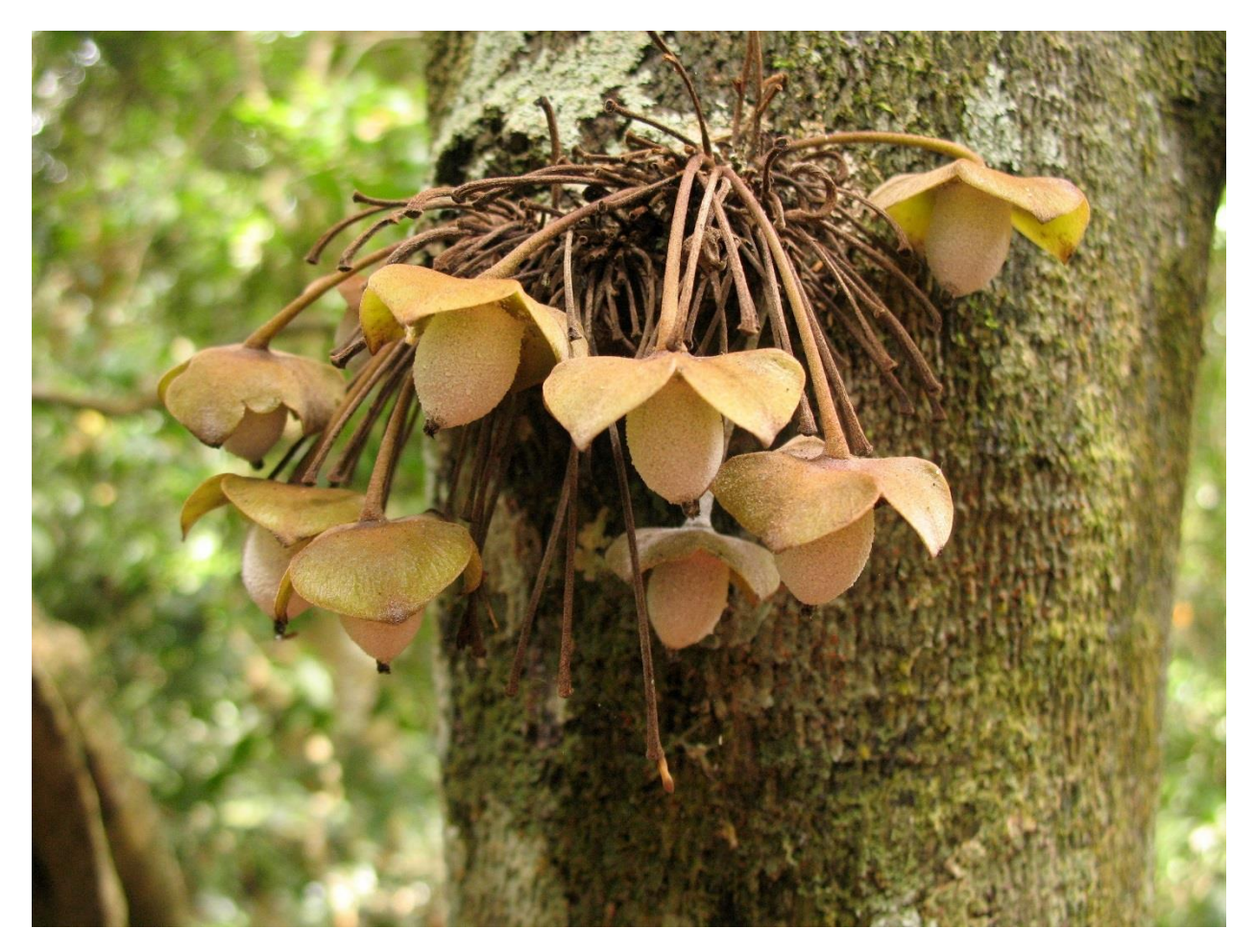
Figure 4. Fruits on the trunk of a tree of Diospyros labatiana, a newly identified species that can reach 16 m tall and almost 30 cm in diameter.

The current taxonomic information and the available identification tools are both seriously inadequate. For instance, individual logs that belong to the same species of Dalbergia could be classified, using today's tools, as either palissander or rosewood, depending on the definition of these two categories and the knowledge of the person identifying the logs. Without reproductive structures, wood samples cannot be assigned with certainty to a species. In its current implementation, the TRAFFIC wood identifier can only classify wood as ebony, palissander or rosewood in the field and cannot identify the corresponding Dalbergia or Diospyros species.<sup>12</sup>