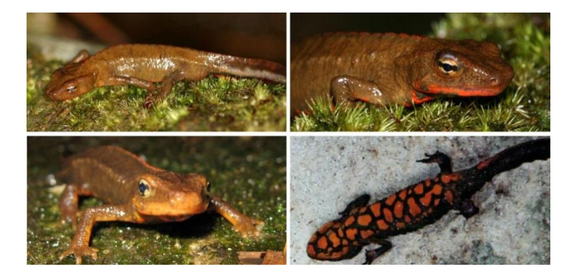
Figure 5. Morphological characteristics of Hong Kong newt