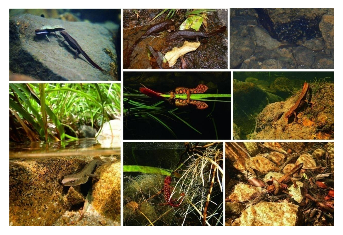
Figure 3. Habit and mating behaviour