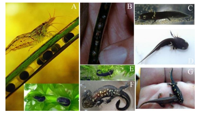
Figure 4. Development and growth of Hong Kong newt A-B :eggs and embryo <sup>,</sup>C-E :larvae <sup>,</sup>F-G :baby Hong Kong newt