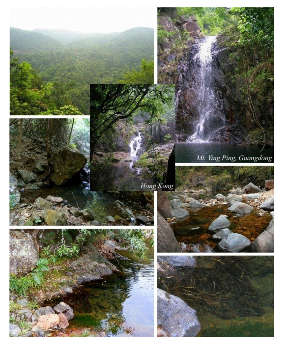
Figure 2. Typical habitat of Paramesotriton hongkongensis