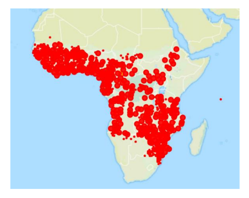
Fig. 1- Natural distribution map of all African Pterocarpus taxa (Pterocarpus Jacq.; CJBG, 2020).

Natural ranges of P. rotundifolius and P. lucens subsp. antunesii do partially overlap.