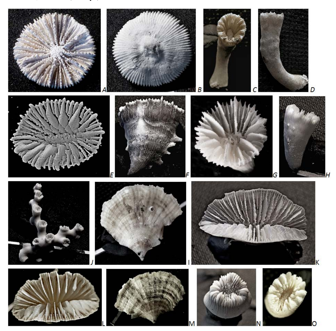
A-B - Anthemiphyllia dentate, spec.33271, C-D - Balanophyllia teres, spec. 33272, E-F – Cariophyllia spinicarens, spec.33273, G-H – Crispatotrochus rubescens, spec.33274, J – Dendrophyllia ijiamai, spec. 33275, I-K – Flabellum politum, spec.33276, L-M – Flabellum pavonium, spec.33277, N - Heteropsammia cochlea, spec.33278, O – Heterocyathus aequicostatus, spec.33279, divide by the scale range 1 cm

Description.— Flabelloid corals 34 -17 mm in diameter and 25-35 mm in height with a small conical pedicel. Calice is elliptical deep. Theca is white or hazel porcelain with a distinct vertical ribbing and horizontal growth rings. Septa arranged in five cycles: S1 = S2 > S3 > S4 > S5. Equal-sized septa of the first two cycles, projecting upwards and flatly falling near the axis, become vertically sheer. Their axial ends are sinuous. Thecal faces of most specimens examined discolored and worn; however, in well-preserved specimens there are narrow brown stripes associated with the theca overlaying every septum. Calicular edge a smooth arc. S4 of smaller coral about 80% width of an S3 and thus more easily distinguished. S5 about half width of an S1-4 and also have moderately sinuous inner edges. Total number of septa is 130. Fossa very deep and elongate. Columella an elongate fusion of inner edges of S1-4, but often obscured from view by the narrow fossa.