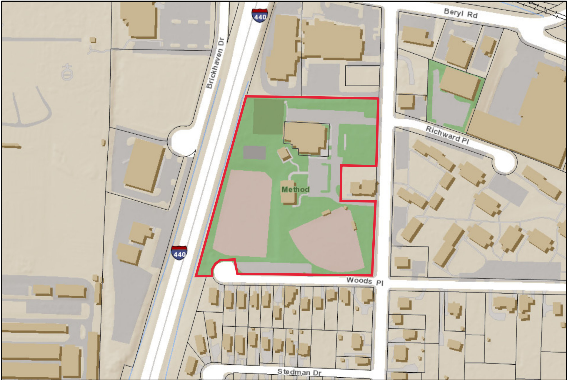
Berry O'Kelly School Landmark Boundary