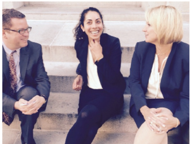
At the Fourth Circuit Court of Appeals