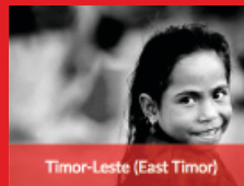
Timor-Leste (East Timor)