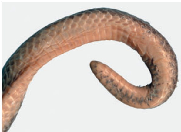
Fig. 6. Tail of the holotype of Calamaria concolor sp. nov., ventral view.