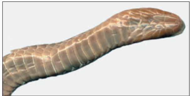
Fig. 5. Head of the holotype of Calamaria concolor sp. nov., ventral view.

Calamaria concolor sp. nov. can be distinguished from all the Indochinese species by relatively wide and flat head and monochrome coloration. Calamaria concolor sp. nov. differs from C. buchi by having fewer ventrals (3 + 209 vs. 221 – 236) and more supralabials (5 vs. 4) (Inger and Marx, 1965); from C. lovii gimletii by the presence of a preocular (which absence in the latter subspecies), fewer number of ventrals (3 + 209 vs. 215 – 249) and more subcaudals (19 vs. 10 – 12), as well as F > PF (contrary condition in C. lovii gimletii ) (Inger and Marx, 1965); from C. lovii ingermarxorum by the presence of a preocular and more supralabials (5 vs. 4) (Darevsky and Orlov, 1992); from C. pavimentata by having more supralabials (5 vs. 4) and lacking body color pattern (dorsum uniform brown vs. dorsum with narrow,