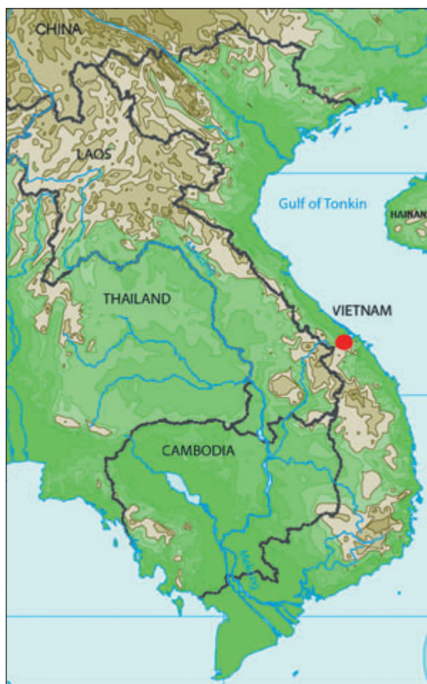
Fig. 7. Map showing the type locality of Calamaria concolor sp. nov.: ●, Bach Ma National Park, Thua Thien – Hue Province, central Vietnam.

fourth entering orbit in C. albiventer ) (Inger and Marx, 1965); from C. schlegeli schlegeli by having greater body length (SVL 536 mm vs. 125 – 391 in males), more ventrals (3 + 209 vs. 3 – 4 + 129 – 161 in males), and supralabials entering orbit (second and third scales vs. third and fourth), mental in contact with anterior chin shields (contrary condition in C. schlegeli schlegeli ) (Inger and Marx, 1965); from C. prakkei by having larger body length (SVL 536 mm vs. 172 – 245 mm), second and third supralabials entering orbit (vs. third and fourth entering orbit), more ventrals (3 + 209 vs. 3 + 126 – 132 in males), and the difference of coloration (body uniform brown without pattern above vs. scattered mid-dorsal scales with a dark central spots, scales of first row yellow in centers forming longitudinal stripes) (Inger and Marx, 1965); from C. ingeri by having second and third supralabials entering orbit (third and fourth entering orbit in latter species), mental in contact with anterior chin shields (separated in C. ingeri ), and the difference of color pattern on back (uniform brown without pattern above vs. 26 incomplete light transverse bands on body and tail) (Grismer et al., 2004).