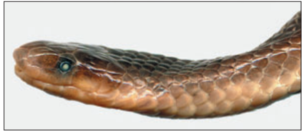
Fig. 4. Head of the holotype of Calamaria concolor sp. nov., lateral view.

colored; back without color pattern; small spots forming a diffuse and indistinct band on ventral side of tail.