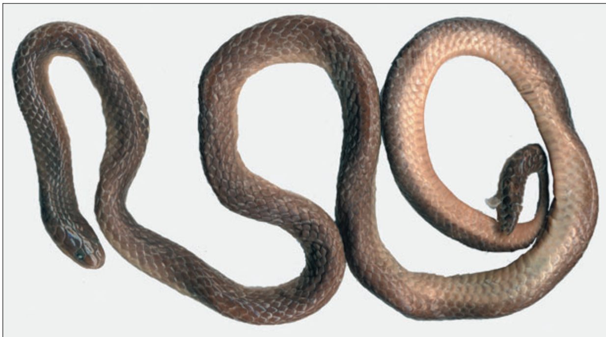
Fig. 1. Holotype of Calamaria concolor sp. nov. (IEBR A.2010.02/ZISP 30185), dorsal view.

Forschungsmuseum Alexander Koenig, Bonn, Germany), MVZ (Museum of Vertebrate Zoology, Berkeley, CA, USA), CIB (Chengdu Institute of Biology, China), USNM (National Museum of Natural History, Division of Amphibians and Reptiles, Washington, D.C., USA) and ZISP (Zoological Institute, St. Petersburg, Russia).