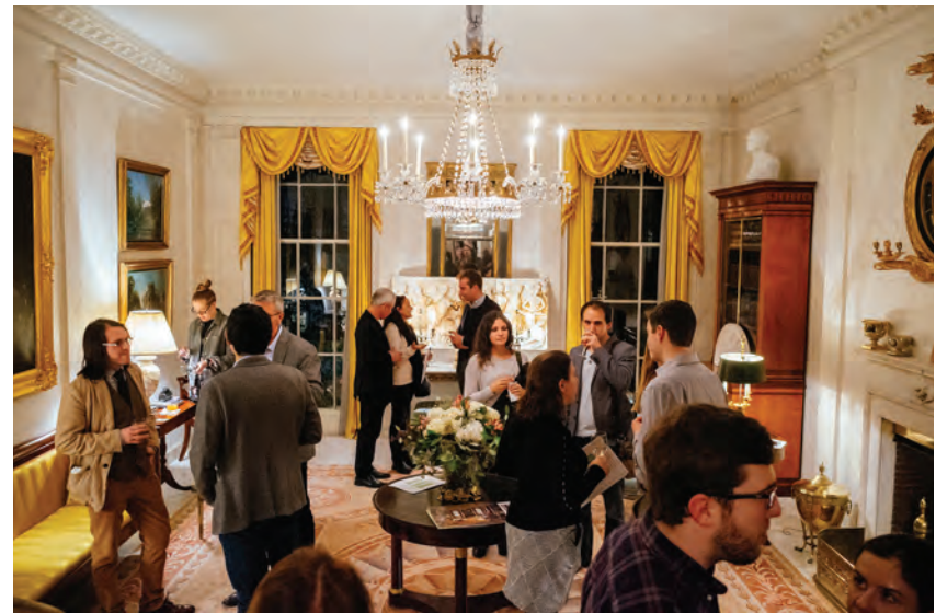
An exhibition featuring twenty-three young artists and designers working in the classical tradition held against the backdrop of Delano & Aldrich's historic George F. Baker House was a highly successful collaboration with the Institute of Classical Architecture and Art. A diverse range of works included drawings, busts, plaster casts, and furniture.