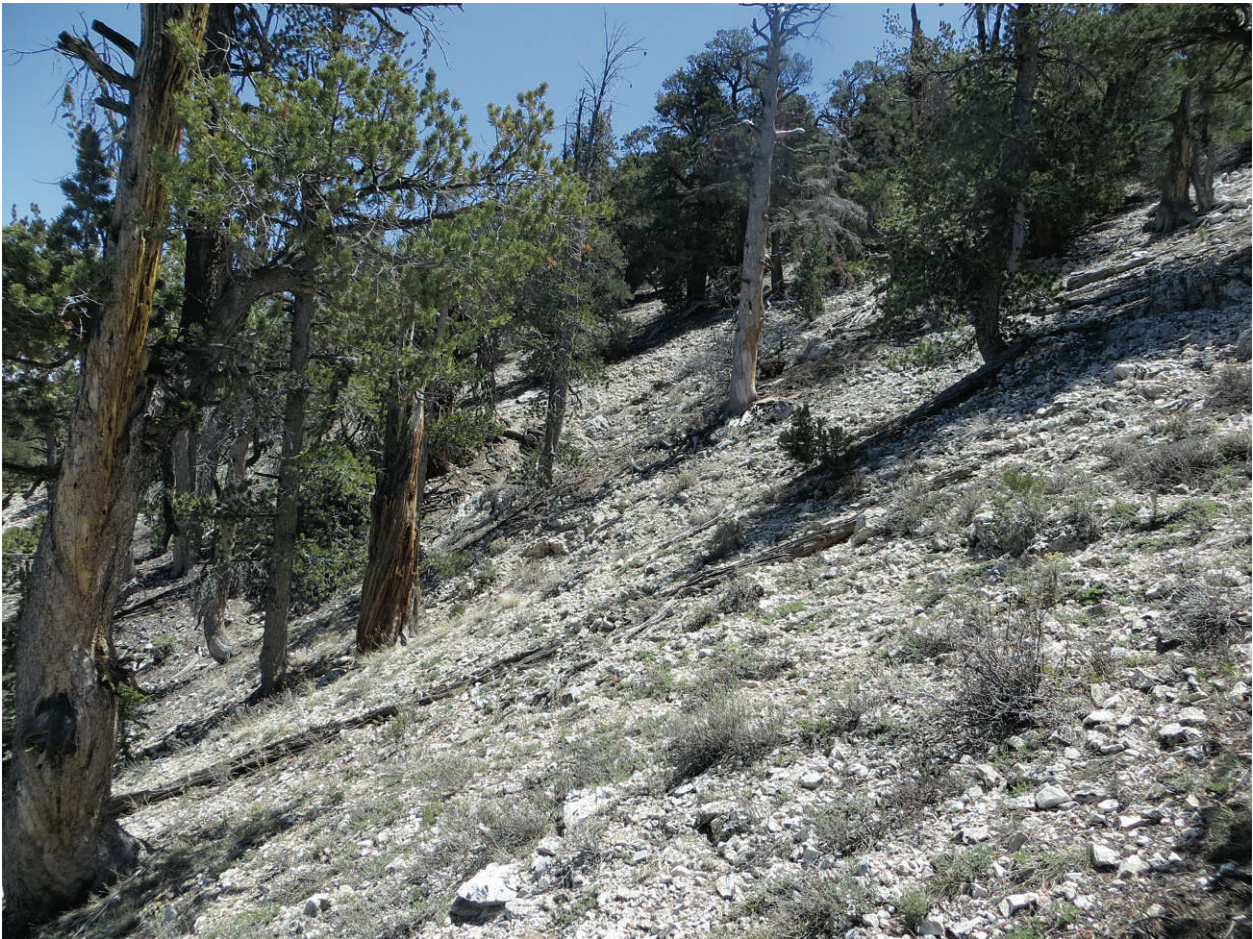
Fig. 3. Habitat of Claytonia lanceolata . Photo taken on the north slope of Bertha Ridge in the San Bernardino Mountains, southern California, near the initial discovery site of C. lanceolata var. peirsonii . White dolomite rocks characterize the landscape that is dominated by open woodland of both Pinus flexilis and P. monophylla , along with Juniperus grandis . Plants occur in dense populations on these steep hillsides underneath the shade of trees in heavy duff as well as in open sun amongst rocks.

1995; Soza and Boyd 2000; CPC 2010; CNPS 2013) suggest that C. lanceolata var. peirsonii is typically found blooming next to melting patches of snow on north-facing slopes, often in open sun amongst rocks (Fig. 3) or in shady areas with dense conifer litter (not pictured). At a more inclusive level, this taxon is described as occurring on unstable talus below ridgelines in lodgepole forest or upper montane, mixed coniferous forest habitats. Claytonia lanceolata var. peirsonii is on CNPS list 3.1, which means “needs review, but seriously endangered in California” (CNPS 2013). The purpose of this manuscript is to provide a review of the literature and draw together observations made in the field and from herbarium specimens so a more appropriate conservation status can be formulated for populations in southern California that meet the description of C. lanceolata var. peirsonii .