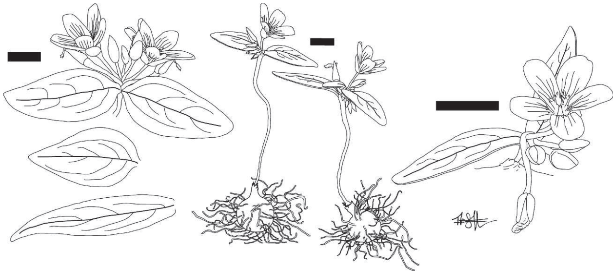
Fig. 10. Line drawing of Claytonia lanceolata var. peirsonii . Note the short above-ground stem, and variation in leaf shape. The variety differs from many members of the C. lanceolata complex by having entire (as opposed to notched) petals, but in common with other members its flowers have pink veins and yellow spots at the base of the petals. Generally, plants in the San Bernardino Mountains have narrower leaves than those in the San Gabriel Mountains from which the variety was originally described. All scale bars = 1 cm. Line drawing by first author.

Given the various issues in taxonomic research more broadly discussed by Venu (2002), we think that some subtle, yet informative, taxonomic characters exist for the southern populations of C. lanceolata that may be obscured during the process of making herbarium specimens. Aside from the ecological setting, the majority of characters most readily used to distinguish this species are undoubtedly best observed in the field, including inflorescence architecture, floral morphology, and cauline leaf shape.